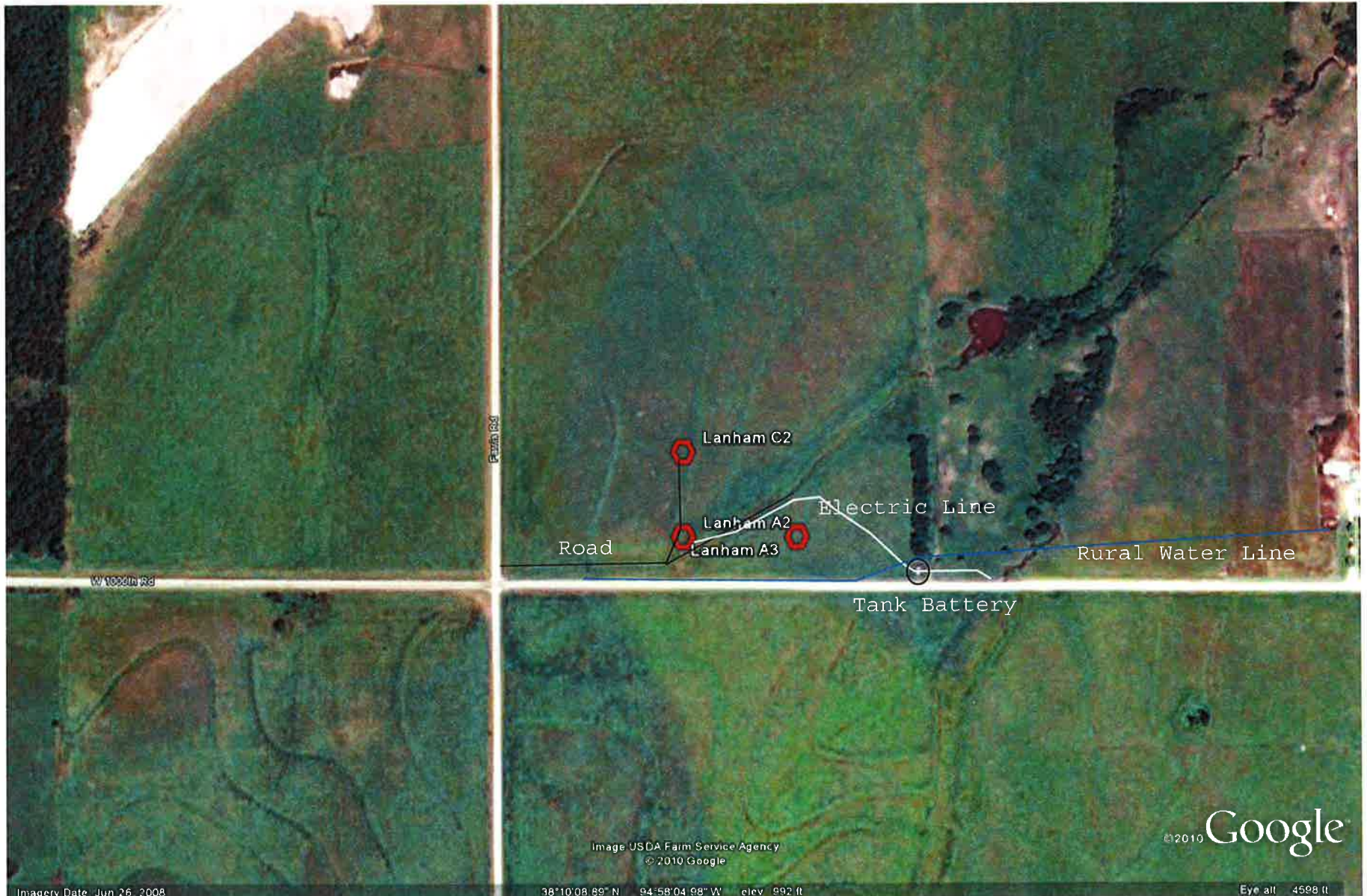
Tank Battery is within the black circle; The roads are marked in black; The Rural Water Line is marked in blue and the electric line is marked in white.