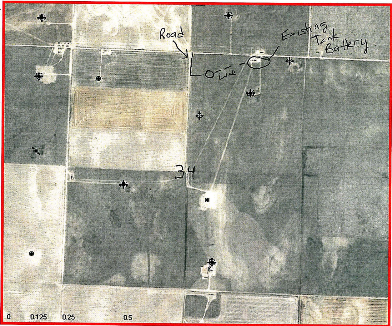
Location of White Exploration, Inc. Black Stone "B" #5 330' FNL and 2310' FWL (NW NW NE) Section 34-29S-41W Stanton County, Kansas