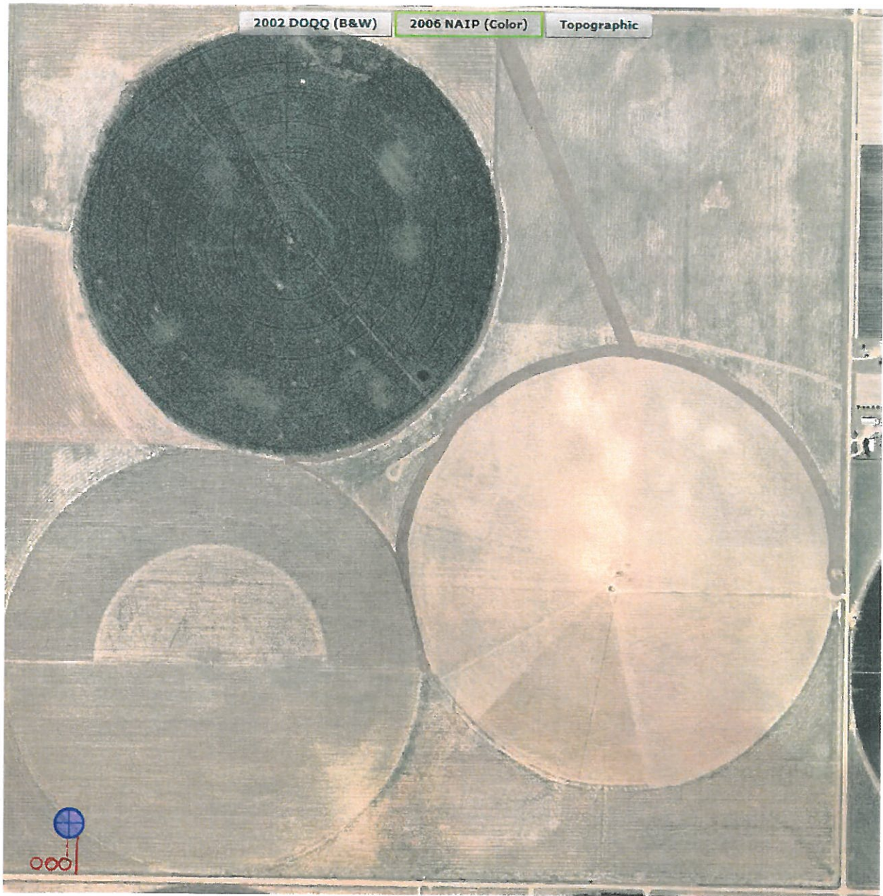
PRELIMINARY NON-BINDING LOCATION OF TANKS/ROADS/LEAD LINES