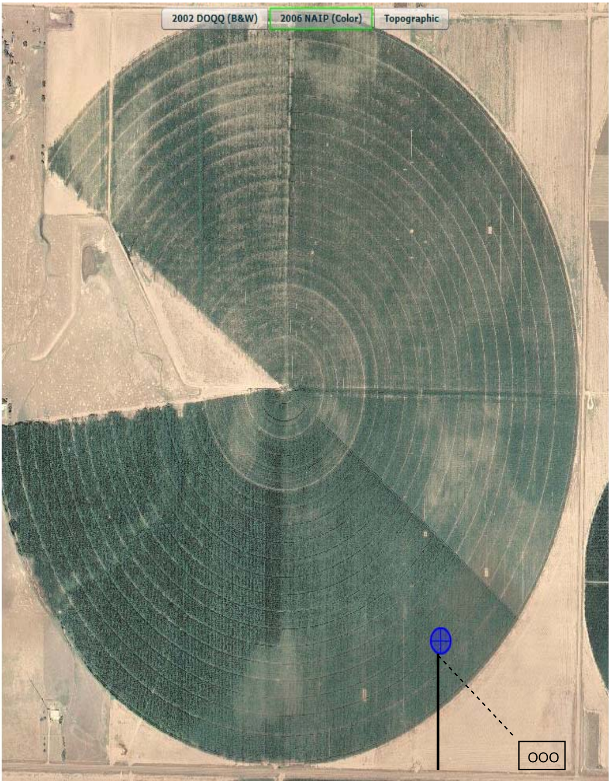
PRELIMINARY NON-BINDING LOCATION OF TANK/ROADS/LEADLINES