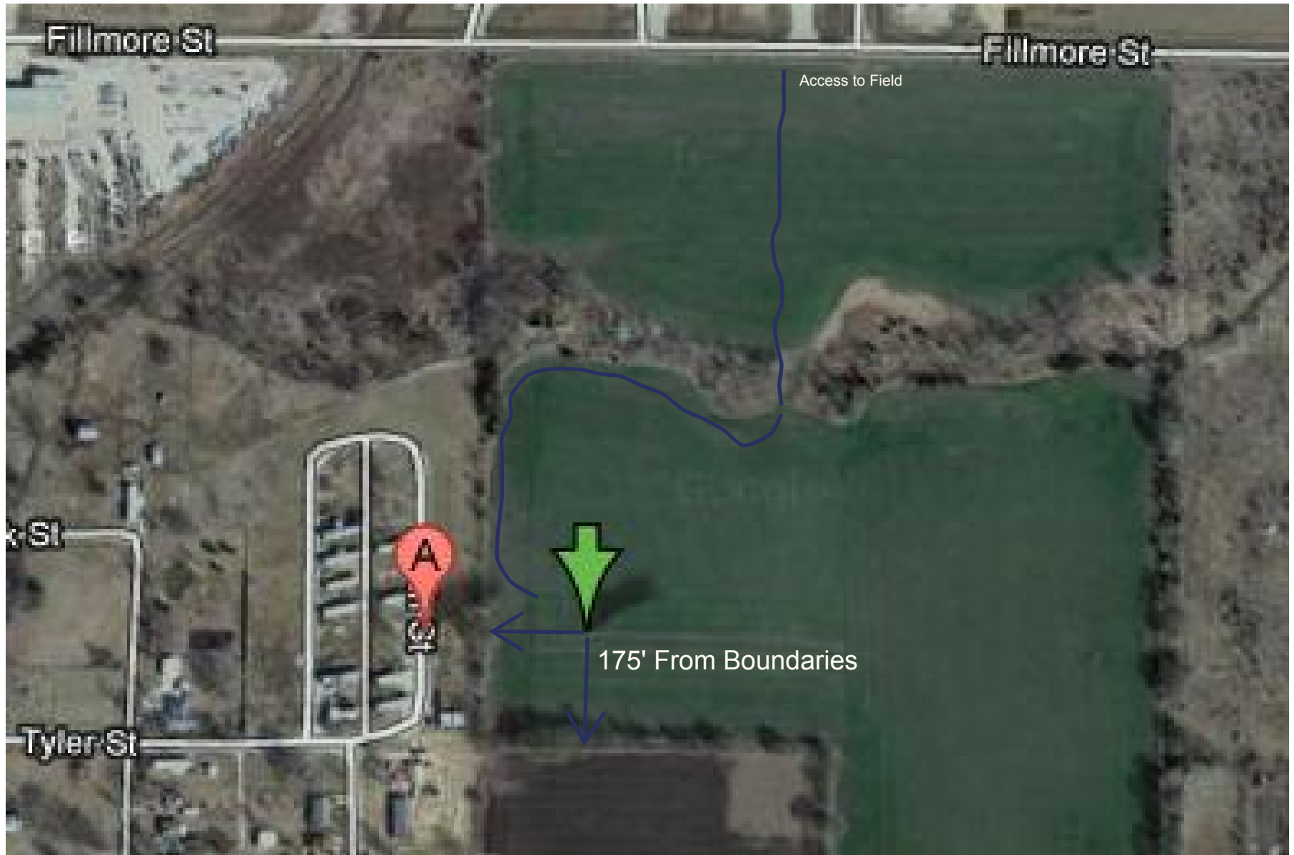
Fortner Lease - New Well Spud Point