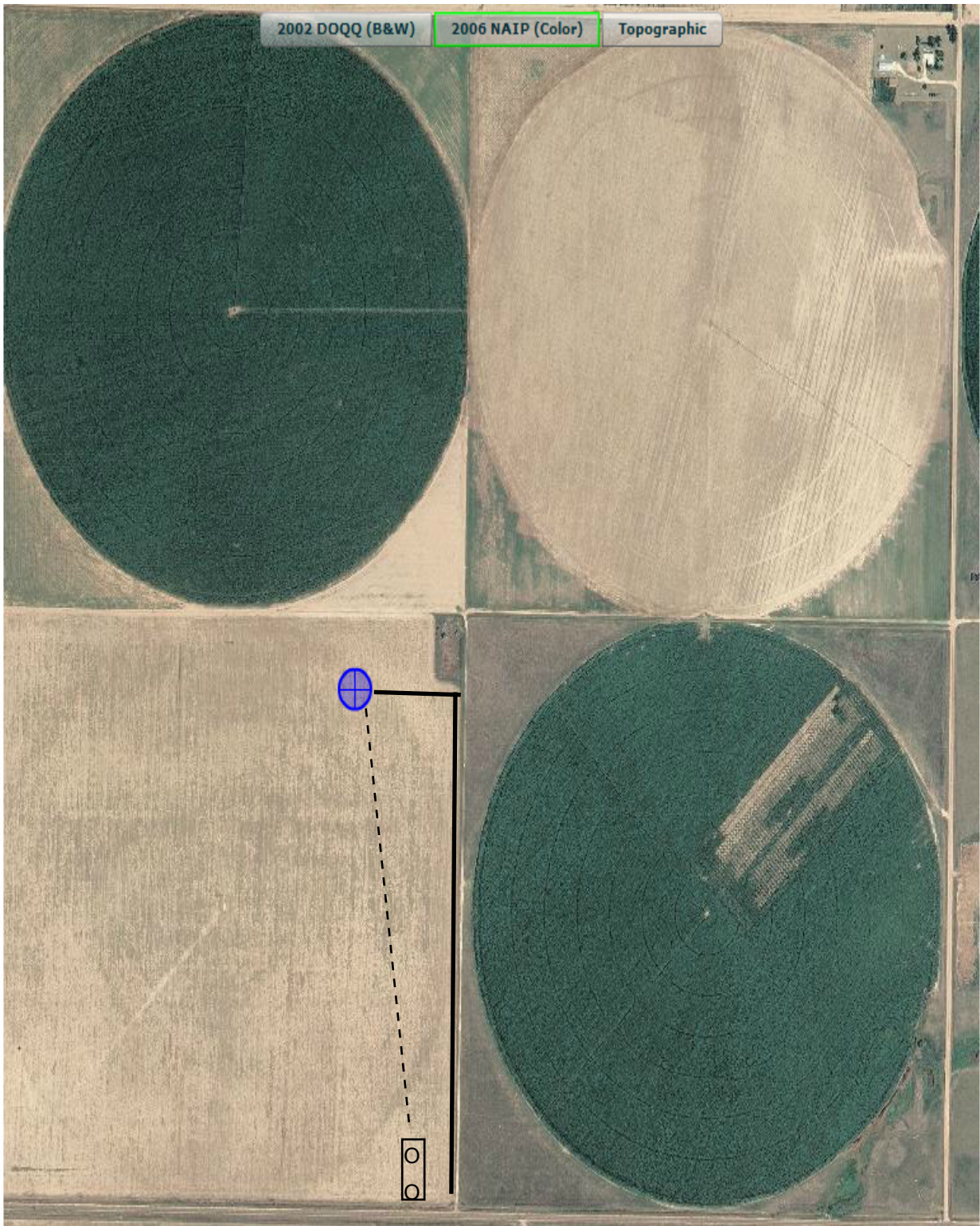
PRELIMINARY/NON-BINDING LOCATION OF ROAD/TANKS/LEAD LINES