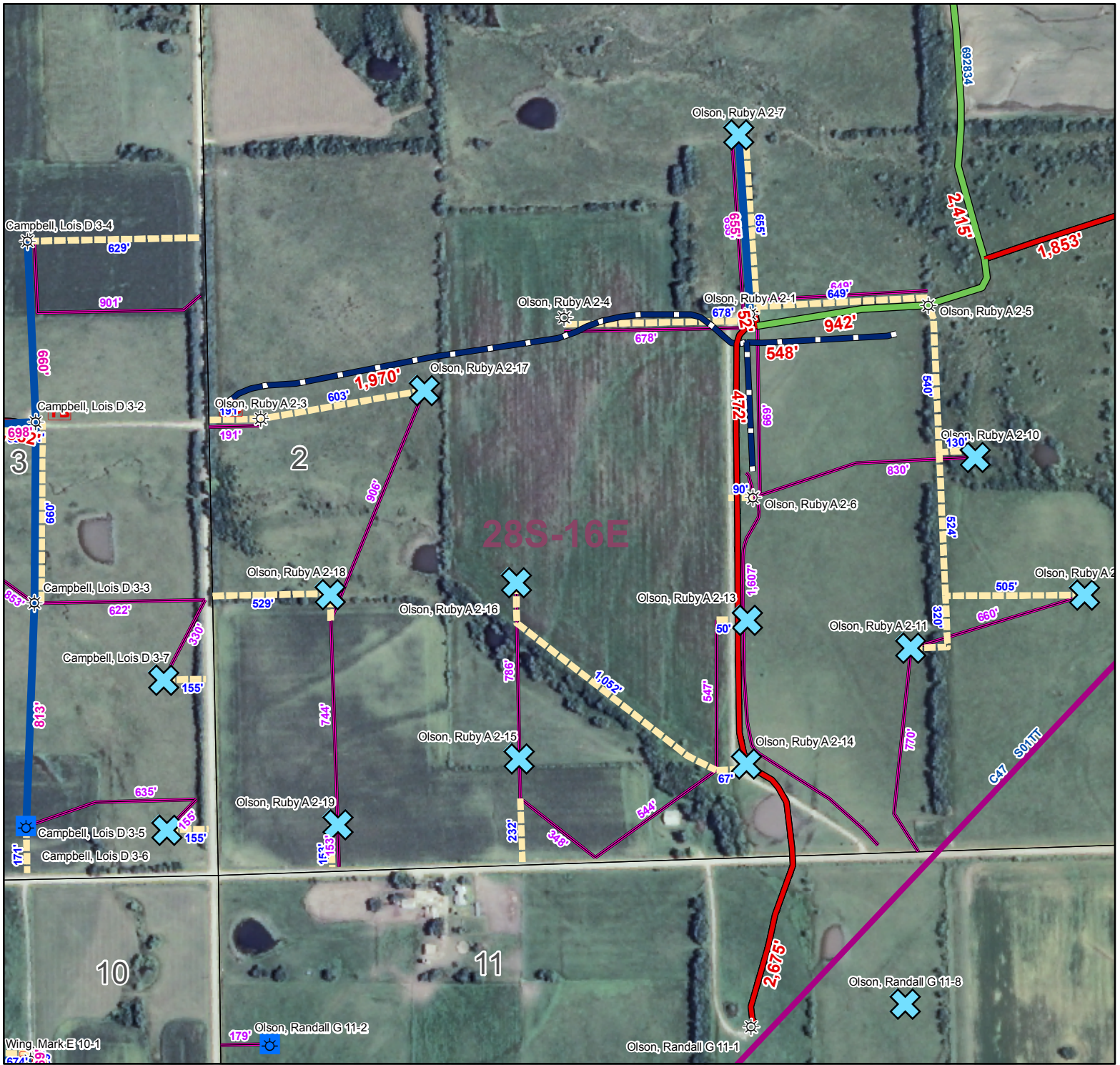
Olson Alternates SW/4 - 2-28S-16E 1" = 500'