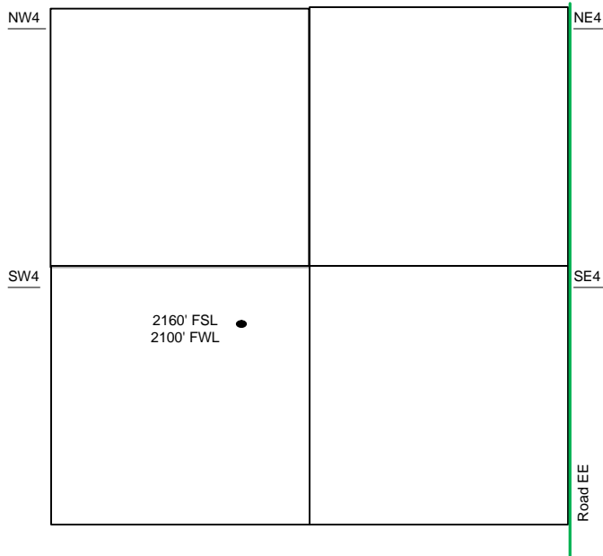
Sec 10 – T28S – R34W