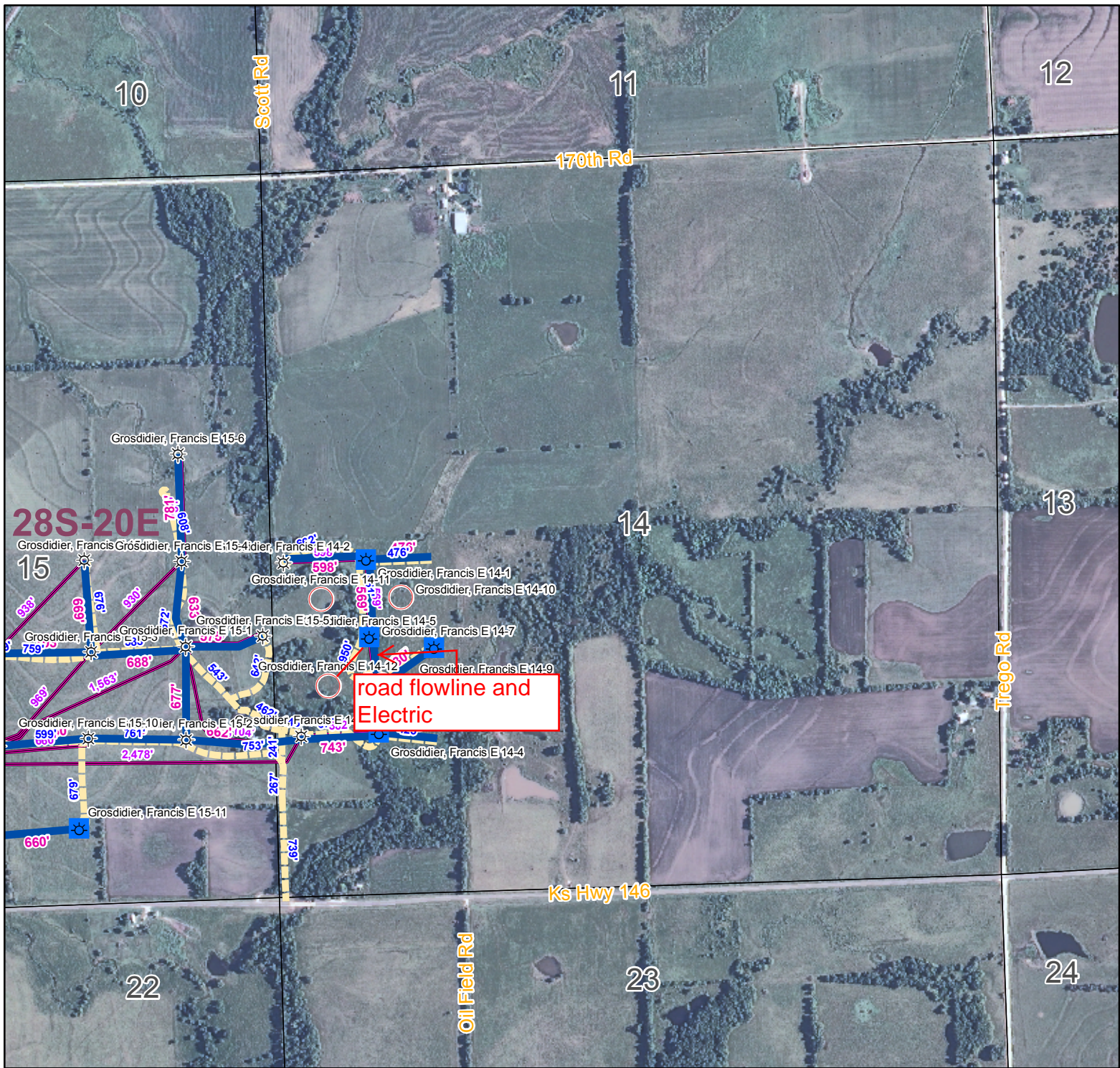
Grosdidier, Francis E 14-9, 10, 11, 12 14-28S-20E 1" = 1,000'