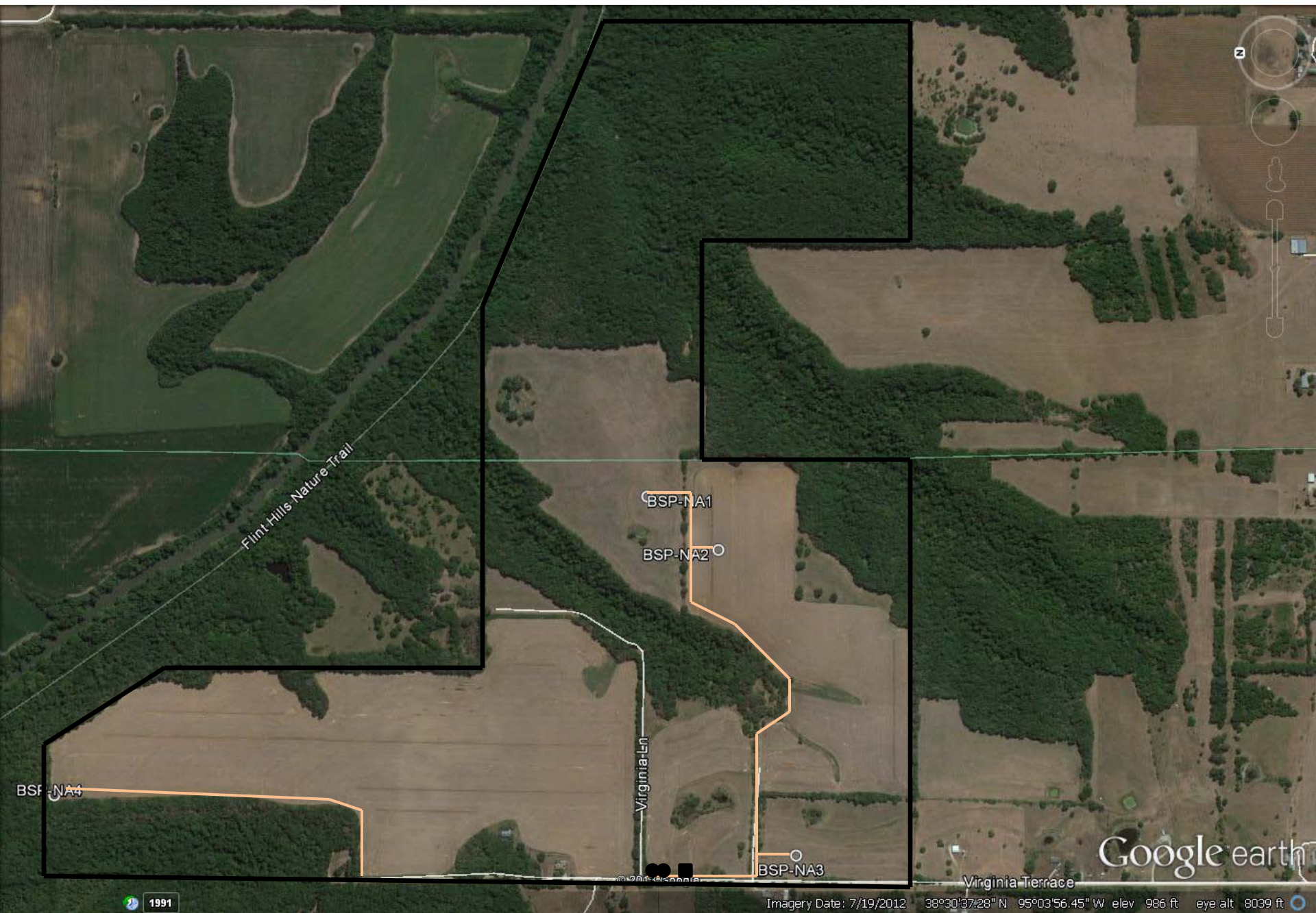
North Austin Lease Map