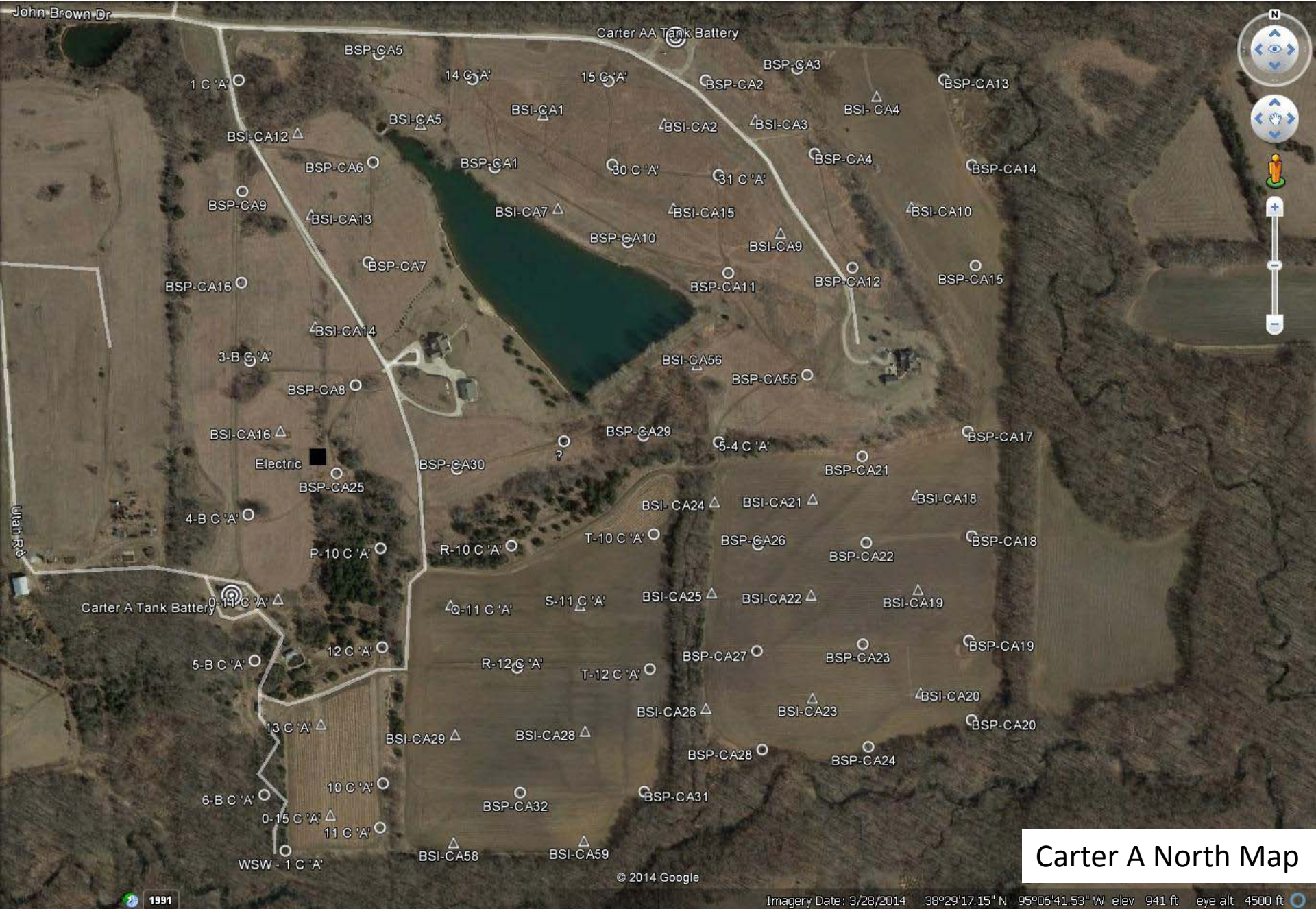
Carter A North Map