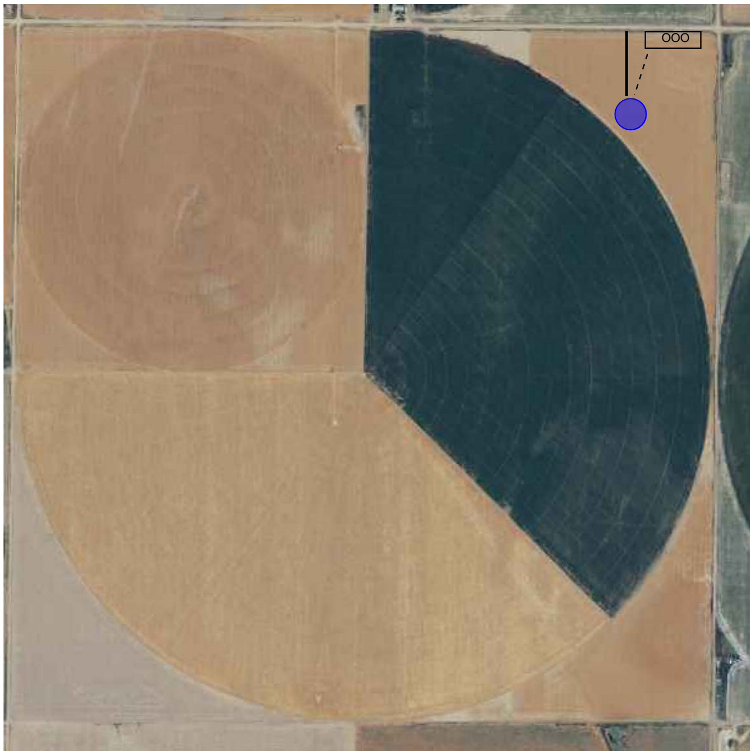
PRELIMINARY NON-BINDING LOCATION OF ROADS/TANK BATTERY/LEADLINES