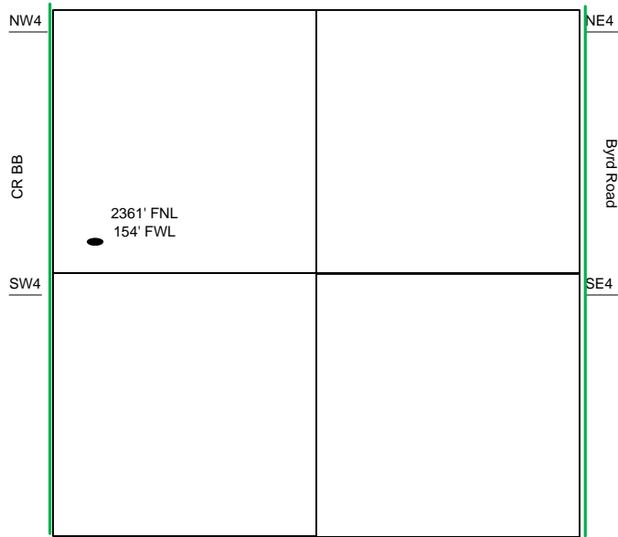
Sec 30 – T23S – R34W