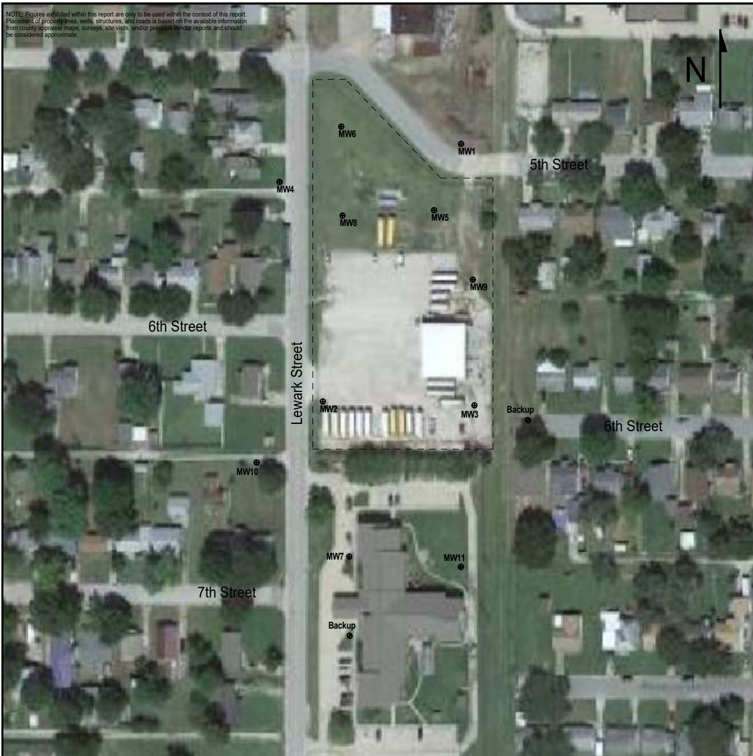
FIGURE 2 - 500 FT RADIUS AREA BASE MAP

NOTE: Figures exhibited within this report are only to be used within the context of this report. Placement of property lines, wells, structures, and roads is based on the available information from county appraiser maps, surveys, site visits, and/or previous vendor reports and should be considered approximate.