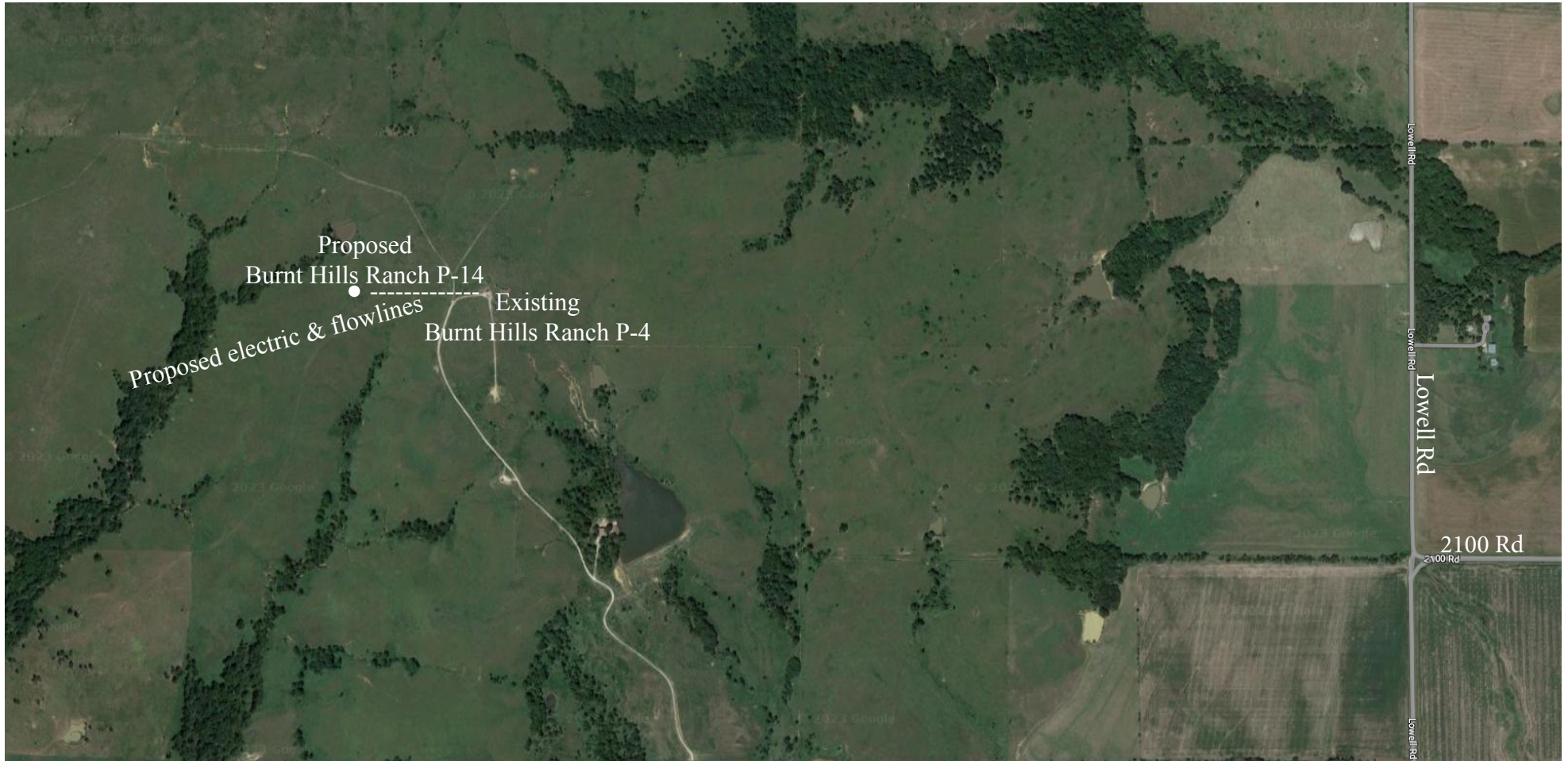
Burnt Hills Ranch P-14 21-27s-15e Wilson County, Kansas