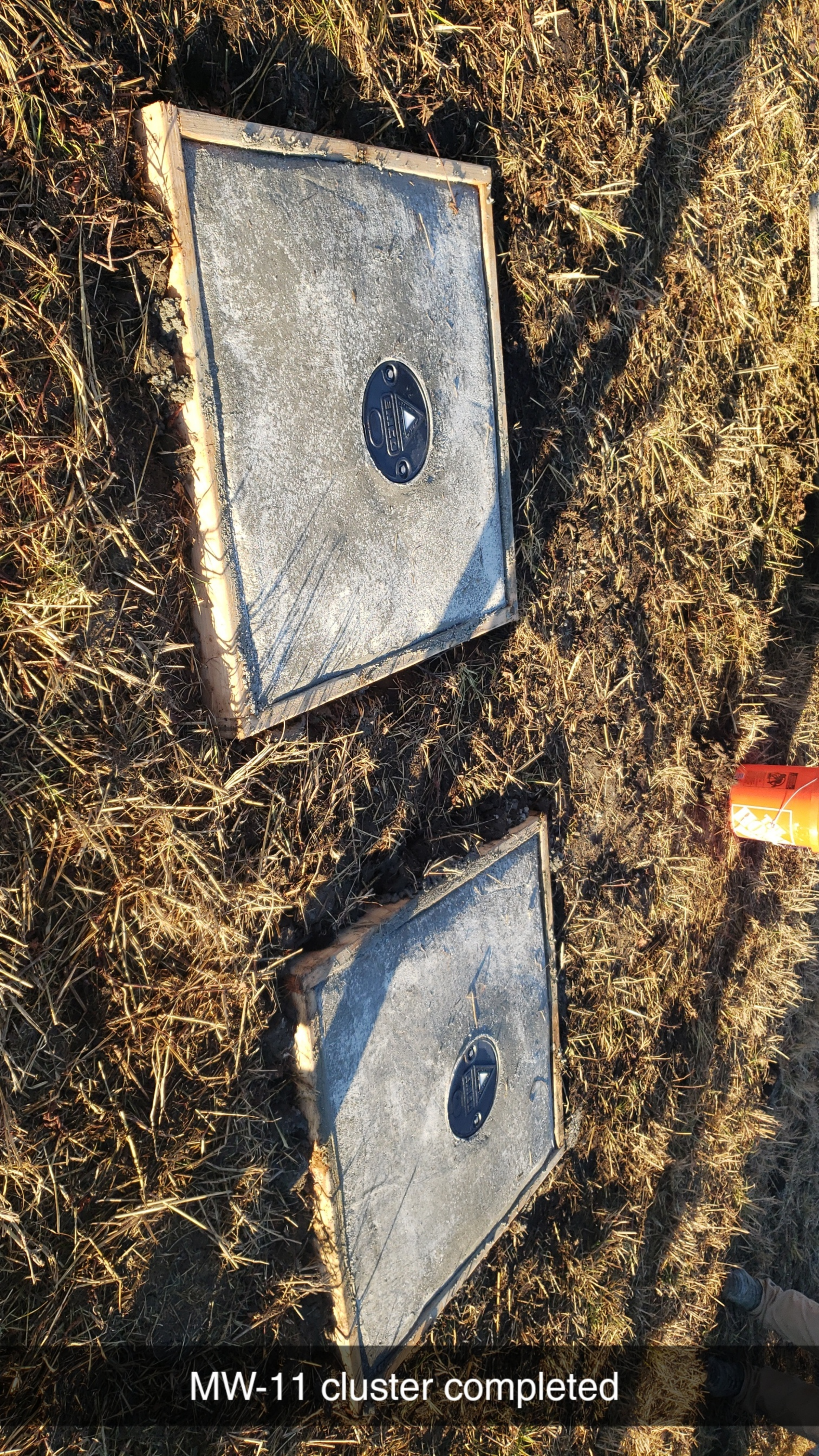
MW-11 cluster completed