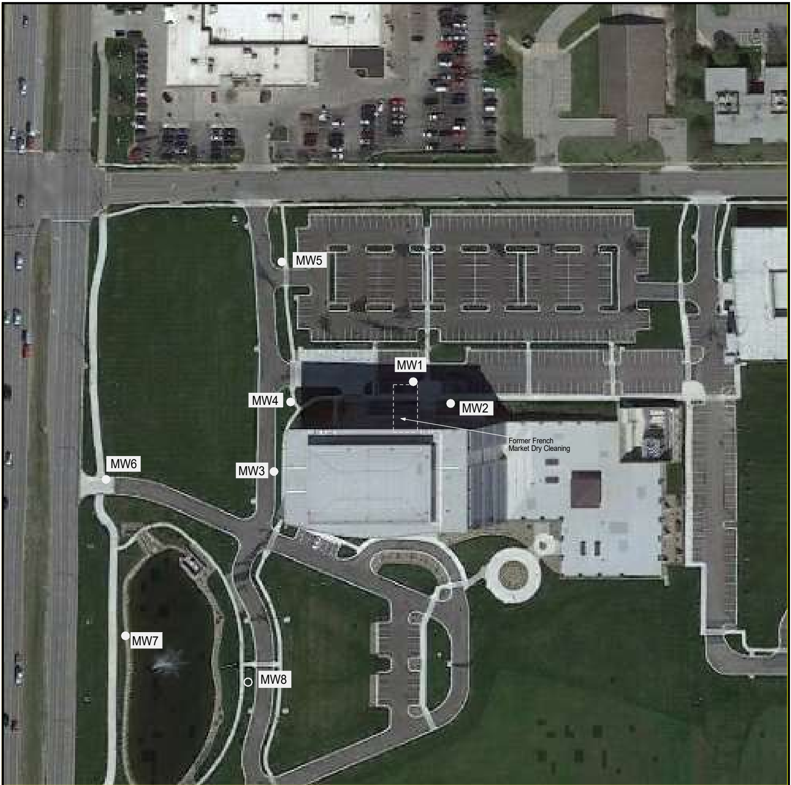
FIGURE 1 - 500 FT RADIUS AREA BASE MAP