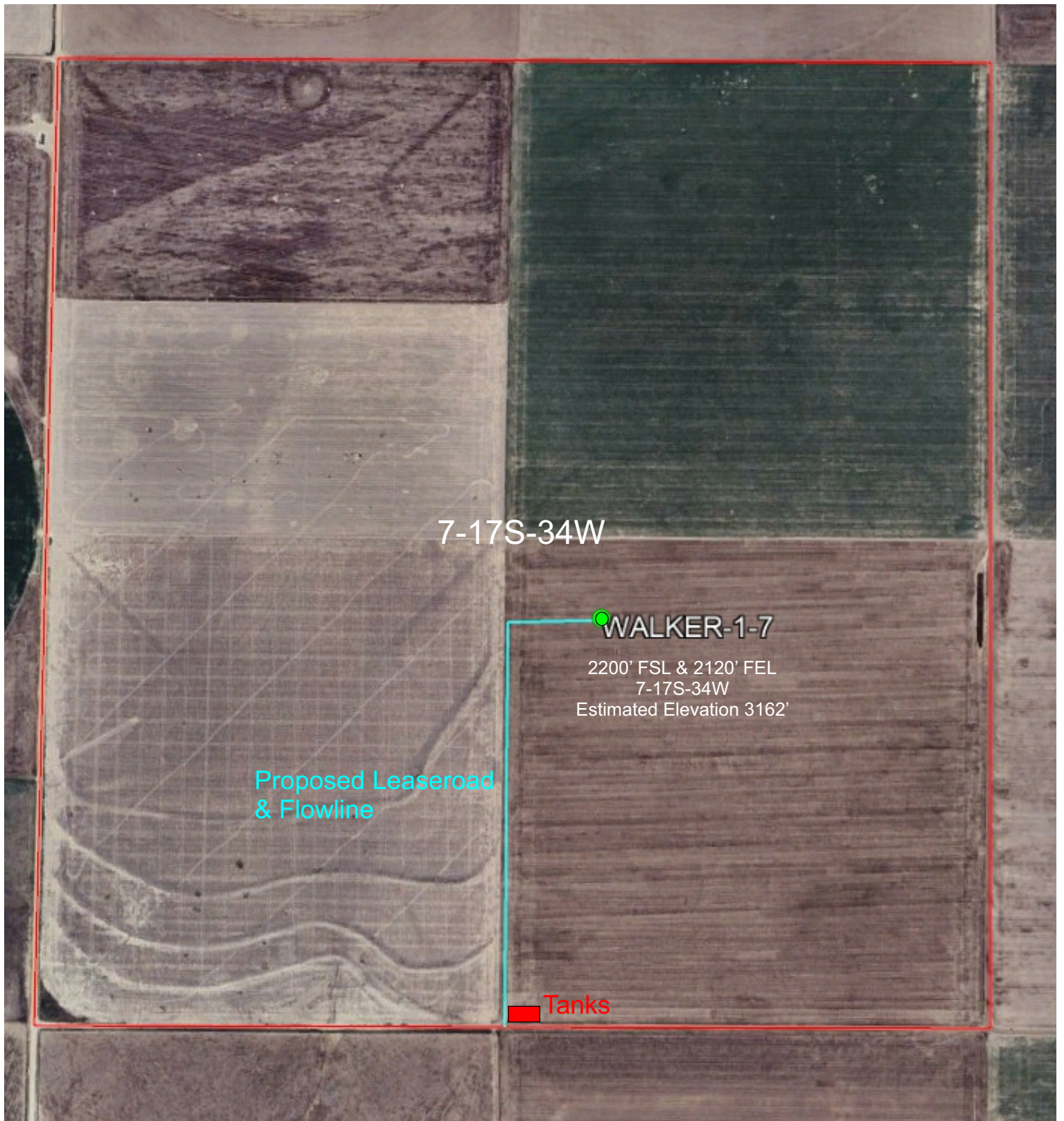
Preliminary, non-binding estimate of leaseroad, flowline, and tank locations