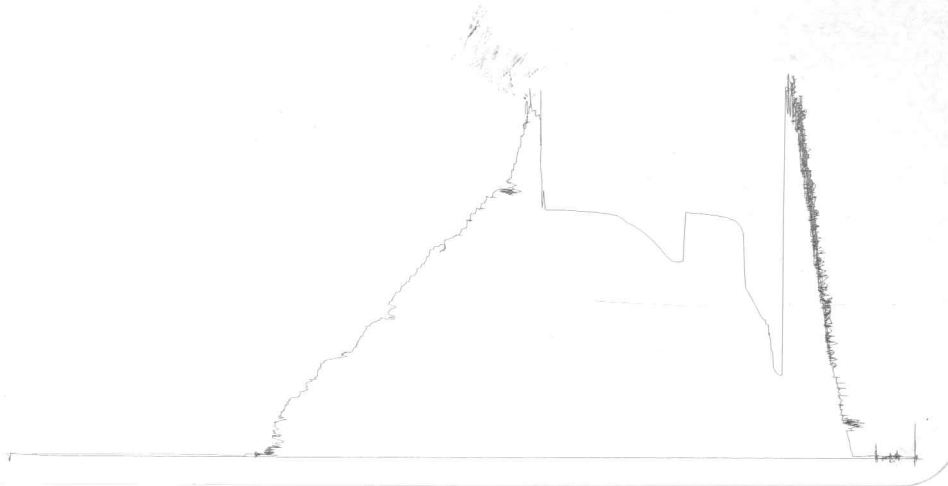
This is an actual photograph of recorder chart.

DST #3 outside 13387 3545-3619 Arbuckle Loc. 3616