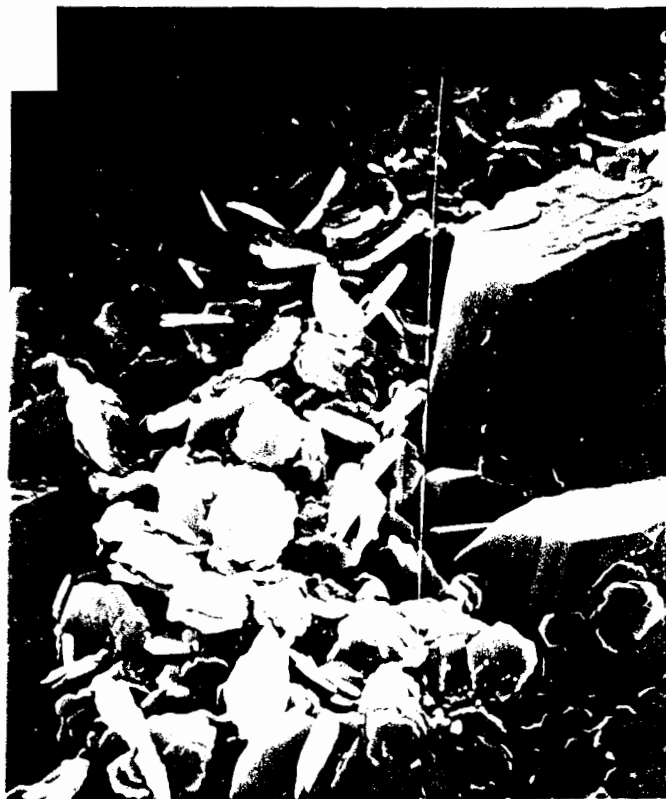
Figure # 12

A close view of authigenic chlorites which are surrounded by extensive quartz overgrowth forms.