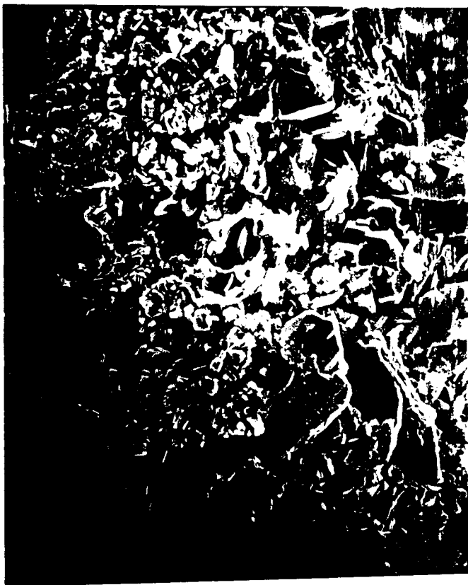
Figure # 8

Authigenic clay minerals (kaolinite, chlorite, and illite), and secondary silica in the sandstone.