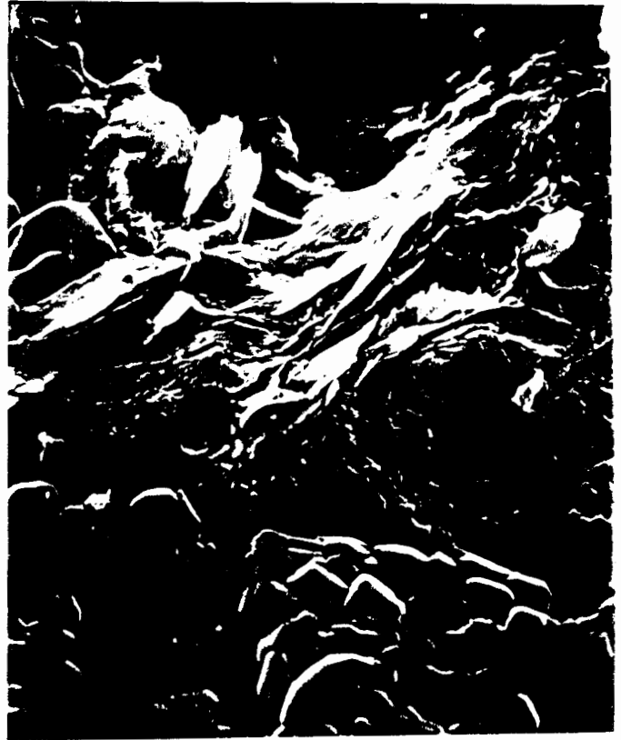
Figure # 10

A close view of detrital illite with a laminar texture which is squeezed between the sand grains.