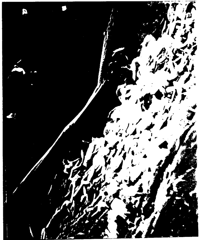
Figure # 14

A higher magnification image of the pore space between the quartz and chert grains in the above figure.