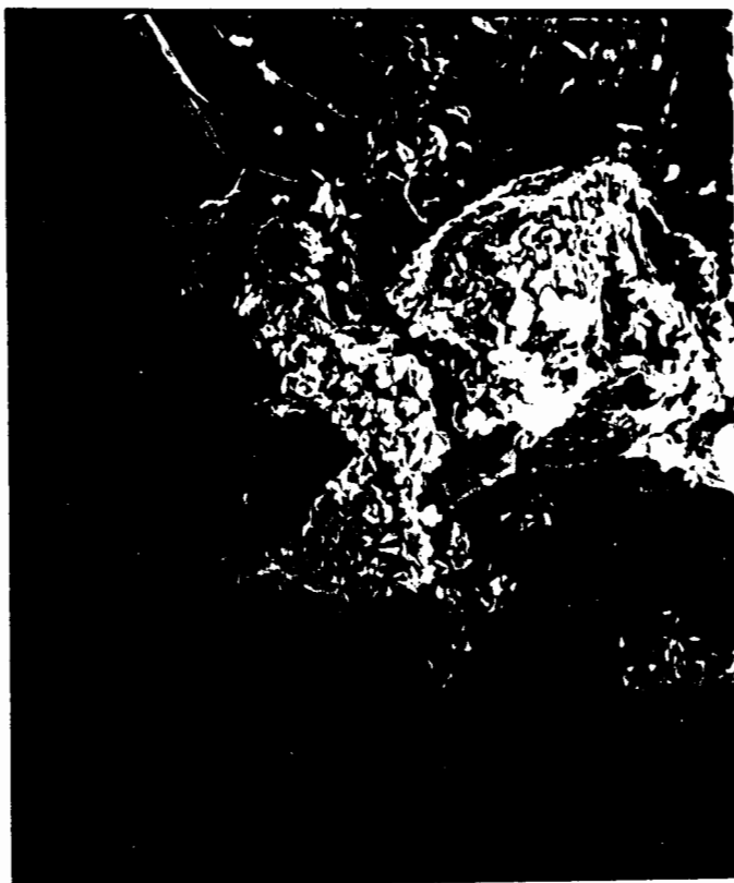
Figure # 6

A general view of the sandstone: fine-grained quartz is heavily coated with authigenic chlorite. The primary quartz grains are extensively covered by overgrowth faces.