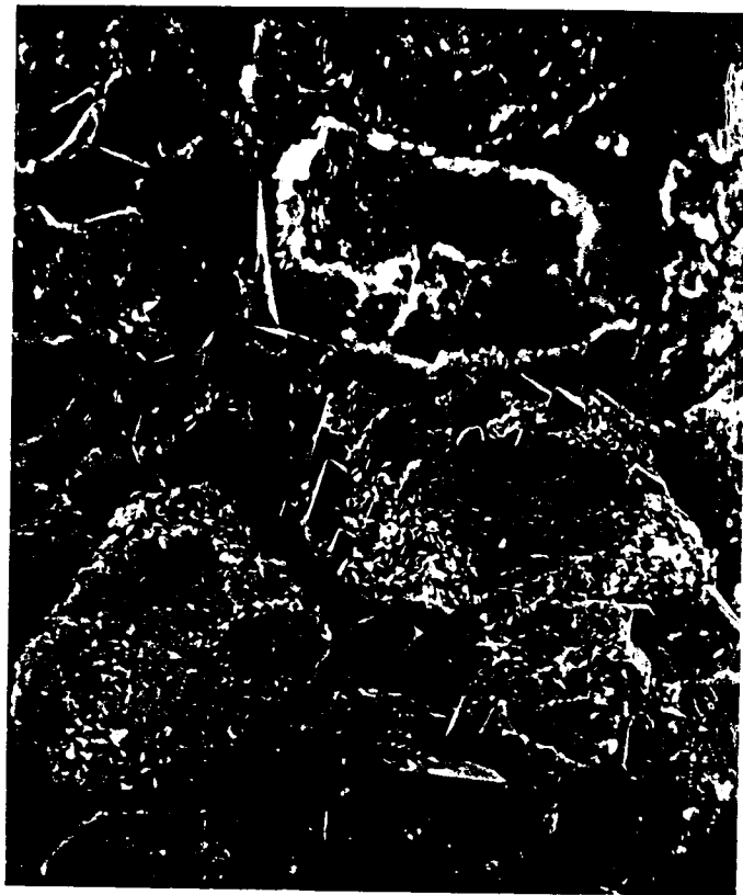
Figure # 2a

A fine-grained sandstone consisting of quartz with overgrowths and clay coatings. An unstable grain (possibly a feldspar) is mostly dissolved. Intergranular (primary) pores are well connected to each other.