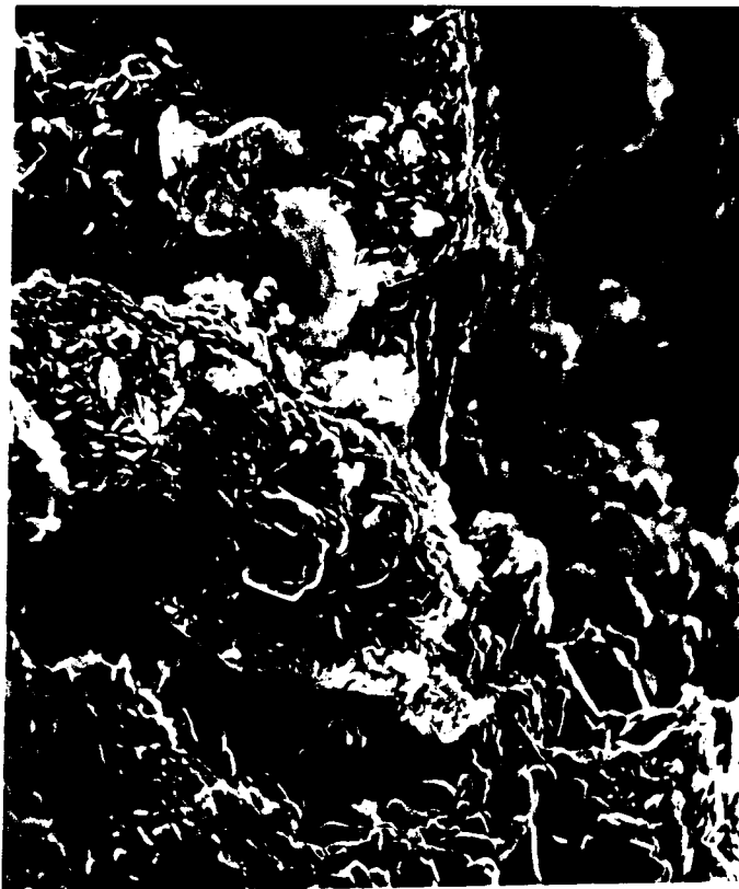
Figure # 4

Authigenic chlorite coatings and microquartz crystals growing on the primary grains of the sandstone.