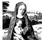
Gerard David: National Gallery Christmas USA 15c

State Corporation Commission of Kansas Conservation Division 245 North Water Wichita, Kansas 67202