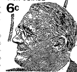
FRANKLIN D. ROOSEVELT