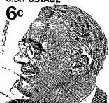
FRANKLIN D. ROOSEVELT