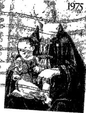
Ghirlandajo National Gallery Christmas US postage