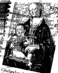
Chirlanduo - National Gallery Christmas US postage

State Corporation Commission of Kansas Conservation Division P. O. Box 17027 Wichita, Kansas 67217