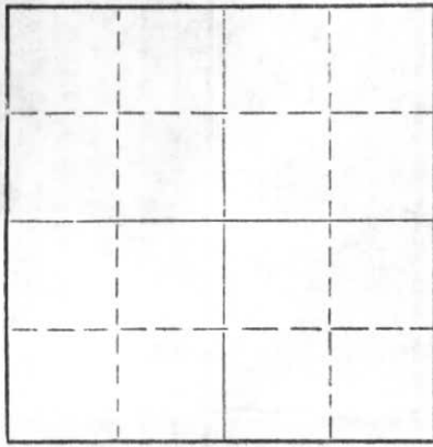
Locate well correctly on above Section Plat

Ellis County. Sec. 9 Twp. 12 Rge. 20 (E) W (W) Location as "NE/CNW/SW" or footage from lines NW NE NW Lease Owner Morgenstern & Specter, Inc. Lease Name Hamburg Well No. 1 Office Address Russell, Kansas Character of Well (completed as Oil, Gas or Dry Hole) _____ Date well completed 1-4-57 19____ Application for plugging filed June 22, 1964 19____ Application for plugging approved June 23, 1964 19____ Plugging commenced 7-1-64 19____ Plugging completed 7-2-64 19____ Reason for abandonment of well or producing formation Depleted.