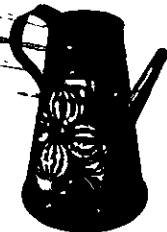
Pennsylvania Pottery Folk Art USA 15c

State Corporation Commission of Kansas Conservation Division 245 North Water Wichita, Kansas 67202