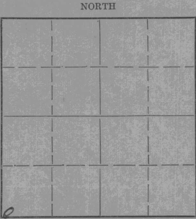
Locate well correctly on above Section Plat

Location as "NE 1/4 NW 1/4 SW 1/4" or footage from lines. Lease Owner: F. S. Williams. Lease Name: Stein. Office Address: McPherson, Kansas. Well No.: 1. Character of Well: Dry. Date well completed: 12-16-48. Application for plugging filed: 12-16-48. Application for plugging approved: 12-16-48. Plugging commenced: 12-17-48. Plugging completed: 12-17-48. Reason for abandonment of well or producing formation: