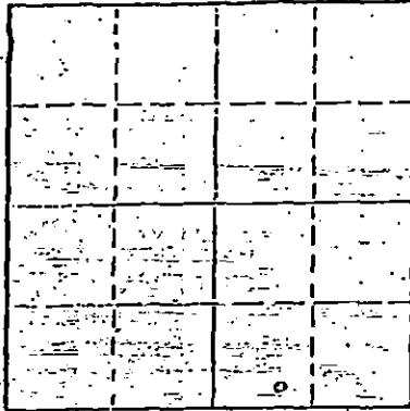
Locate well correctly on above Section Plat

Ness County, Sec. 14 Twp. 20 Rge. (E) 24 (W) Location as "NE/CNW/SW" or footage from lines SE SW SE Lease Owner Meltzer Oil Company Lease Name Petersilie A Well No. 6 Office Address P.O. Drawer B, Great Bend, Kansas 67530 Character of Well (completed as Oil, Gas or Dry Hole) oil Date well completed July 27 19 66 Application for plugging filed April 9 19 76 Application for plugging approved April 29 19 76 Plugging commenced April 29 19 76 Plugging completed May 3 19 76 Reason for abandonment of well or producing formation depleted If a producing well is abandoned, date of last production 19 Was permission obtained from the Conservation Division or its agents before plugging was commenced? YES