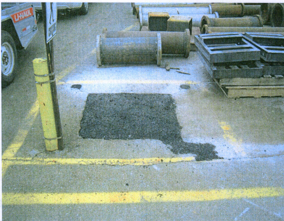
Photograph 4 – MW-3 post plugging. J. Knightly, 1/18/14.