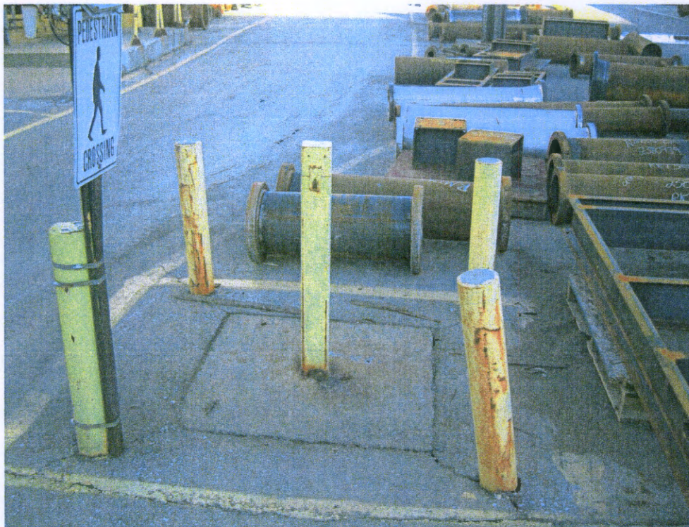
Photograph 3 – MW-3 before plugging. J. Knightly, 1/14/14.