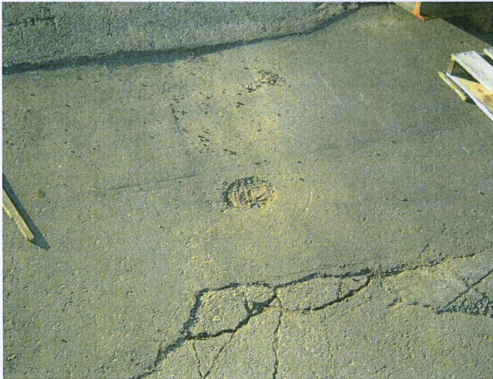
Photograph 9 – MW-10 before plugging. J. Knightly, 1/14/14.