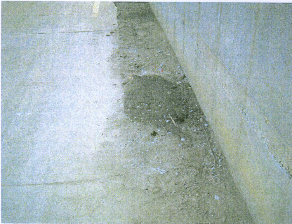
Photograph 14 – MW-13 post plugging. J. Knightly, 1/18/14.