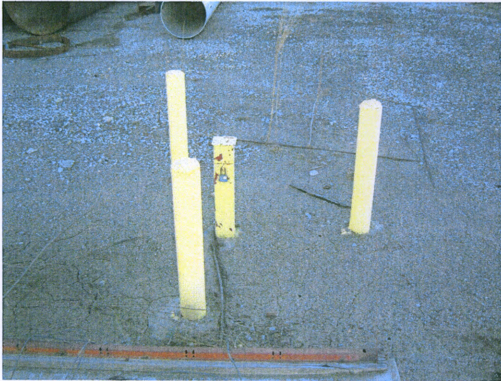
Photograph 17 – MW-15 before plugging. J. Knightly, 1/14/14.