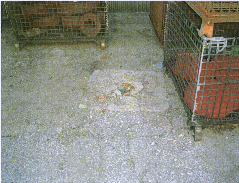
Photograph 19 – MW-17 before plugging. J. Knightly, 1/14/14.