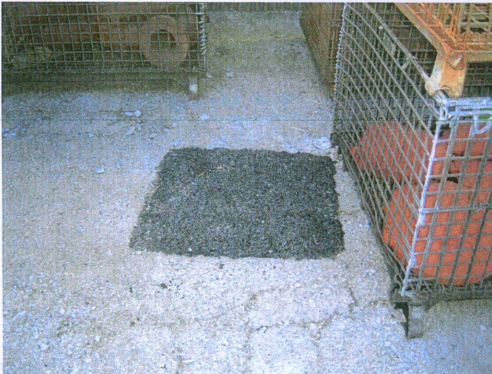
Photograph 20 – MW-17 post plugging. J. Knightly, 1/18/14.