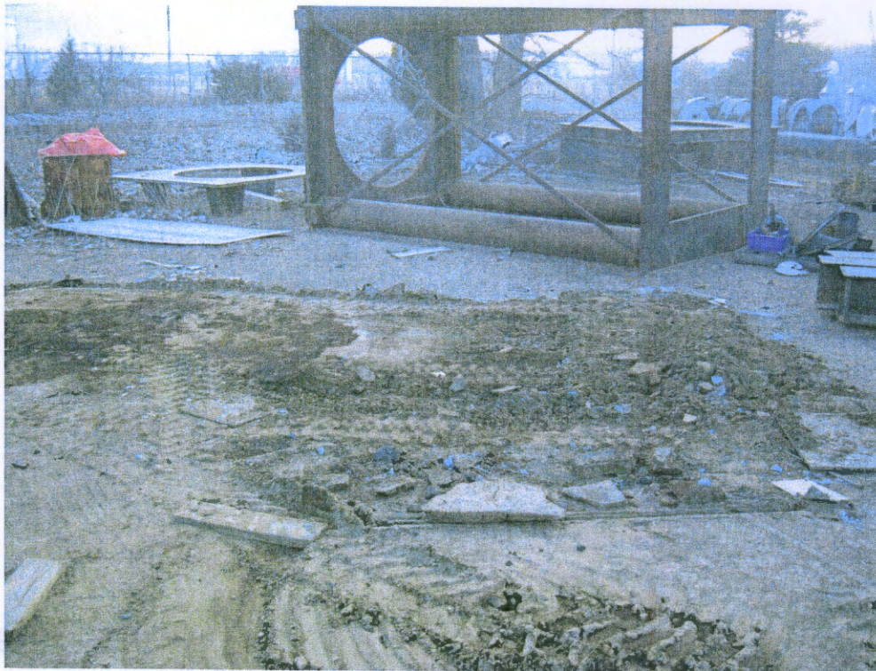
Photograph 24 – MW-20 post plugging. J. Knightly, 1/18/14.