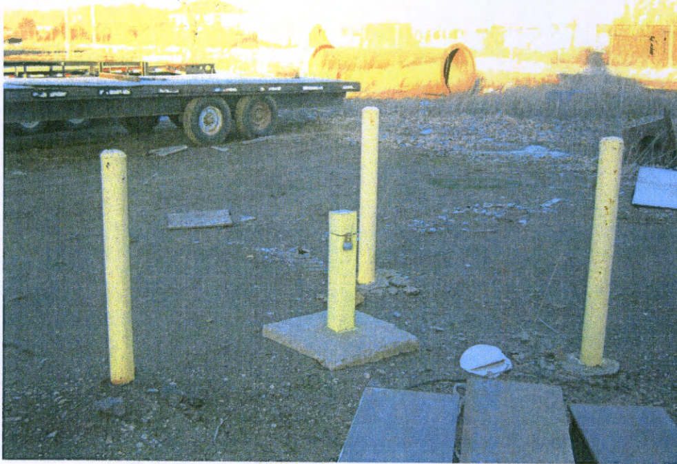
Photograph 23 – MW-20 before plugging. J. Knightly, 1/14/14.