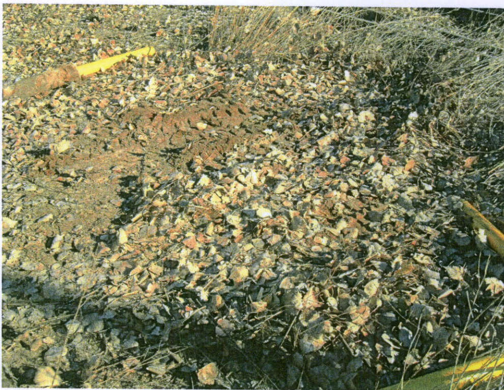
Photograph 34 – MW-25 post plugging. J. Knightly, 1/17/14.