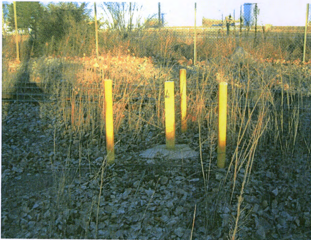
Photograph 33 – MW-25 before plugging. J. Knightly, 1/14/14.