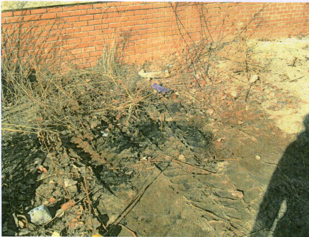
Photograph 26 – MW-21 post plugging. J. Knightly, 1/17/14.