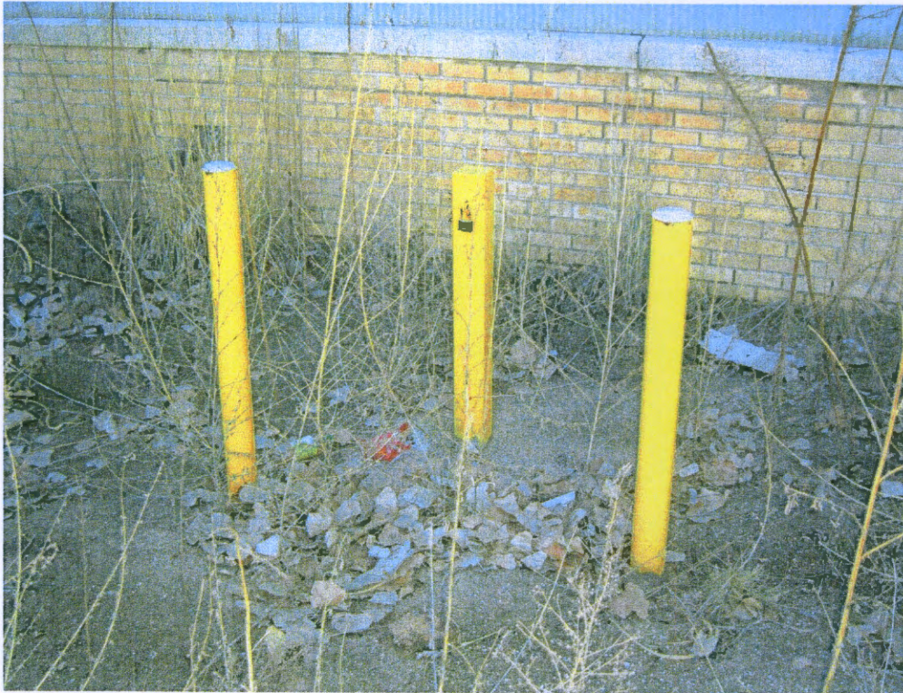
Photograph 25 – MW-21 before plugging. J. Knightly, 1/14/14.