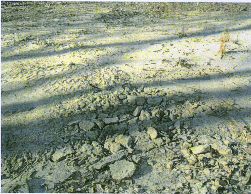
Photograph 32 – MW-24 post plugging. J. Knightly, 1/17/14.