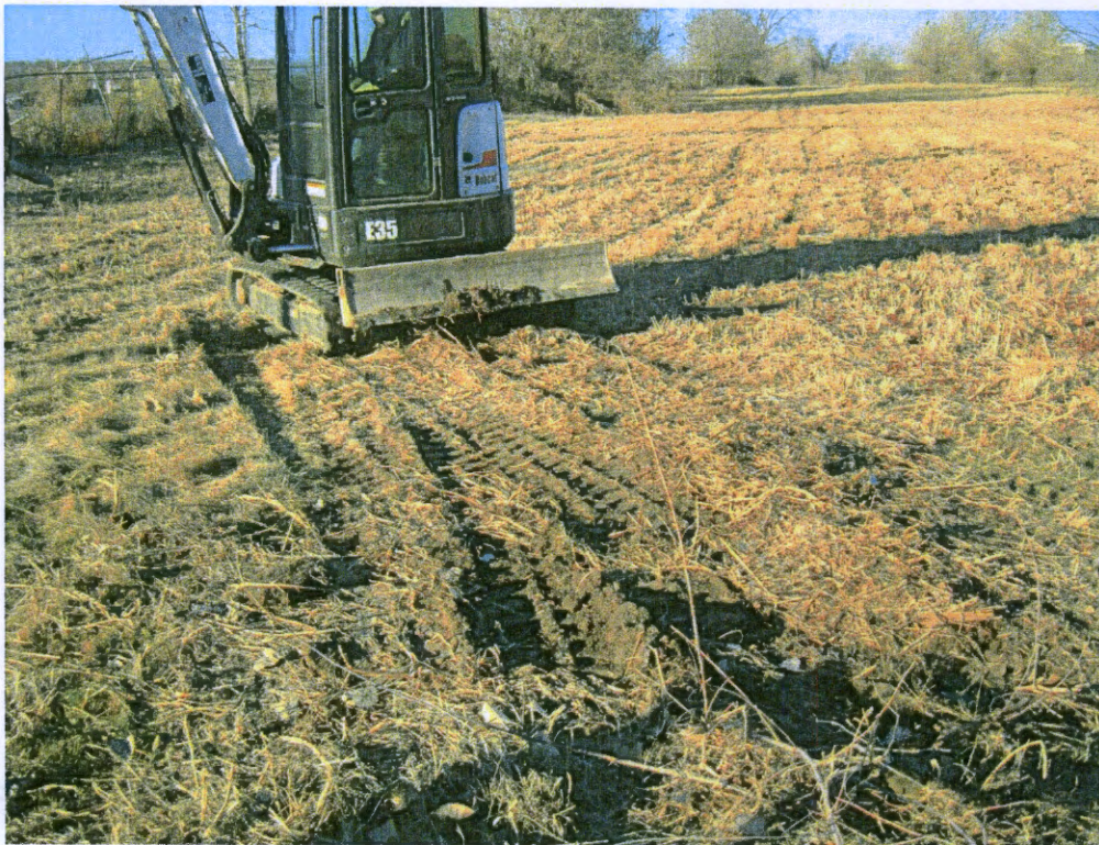
Photograph 30 – MW-23 post plugging. J. Knightly, 1/17/14.