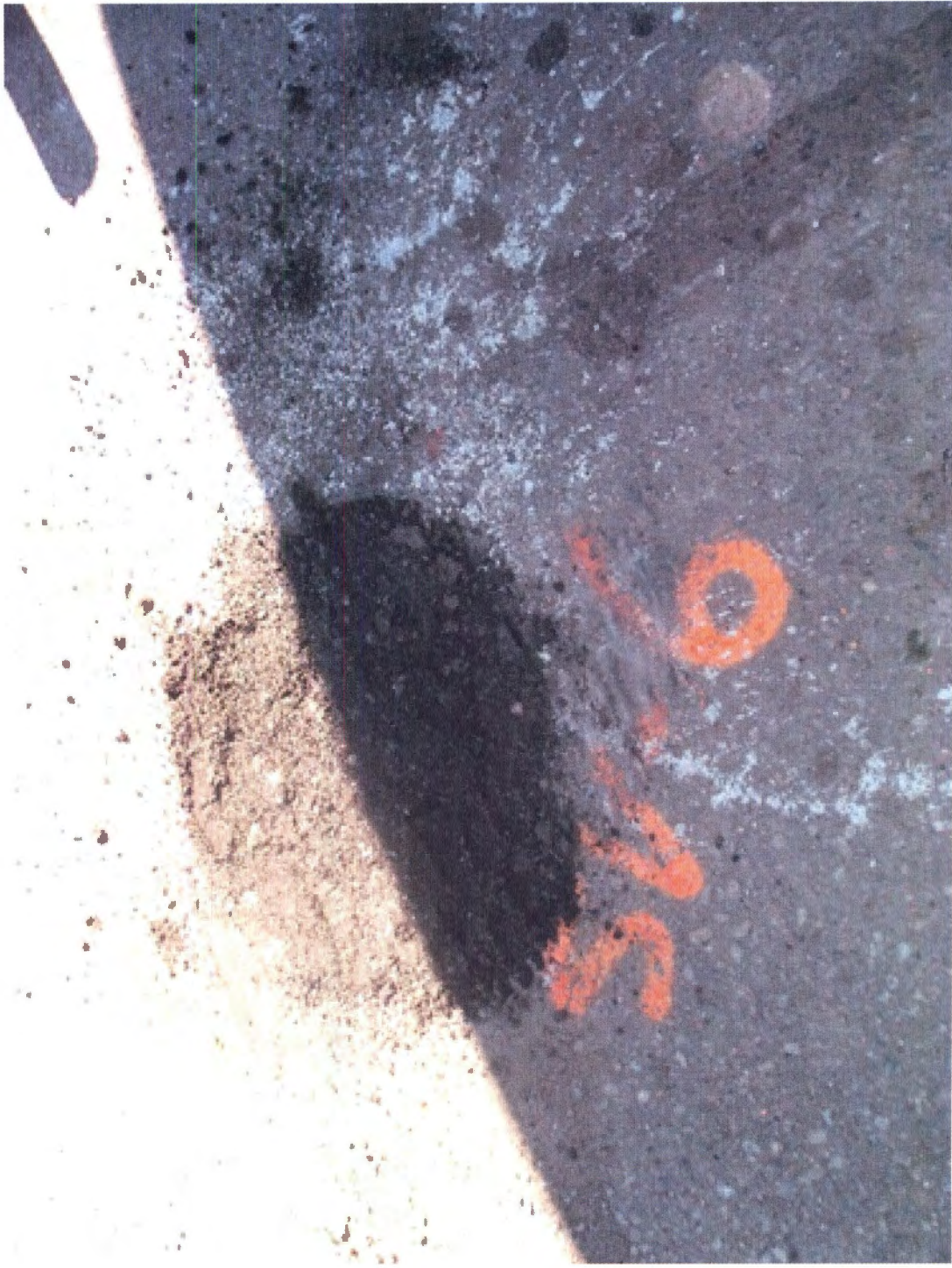
Photos: Plugged SVE-6 – well casing and vault left in place. Gramms 66 site in Quinter, Kansas MILCO Project No. M269-P1-01

MILCO Environmental Services, Inc. 320 W. 4 th Street Colby, KS 67701 Tel: 785-460-1956 Fax: 785-460-4220