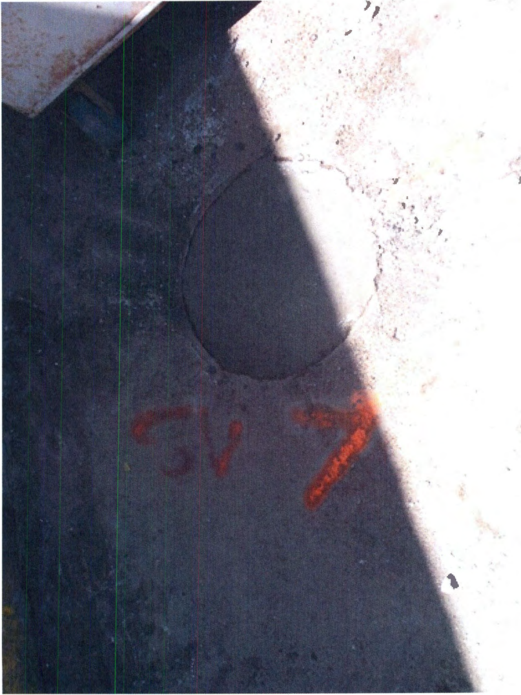
Photos: Plugged SVE-7 – well casing and vault left in place. Grahams 66 site in Quinter, Kansas MILCO Project No. M269-P1-01

MILCO Environmental Services, Inc. 320 W. 4 th Street Colby, KS 67701 Tel: 785-460-1956 Fax: 785-460-4220