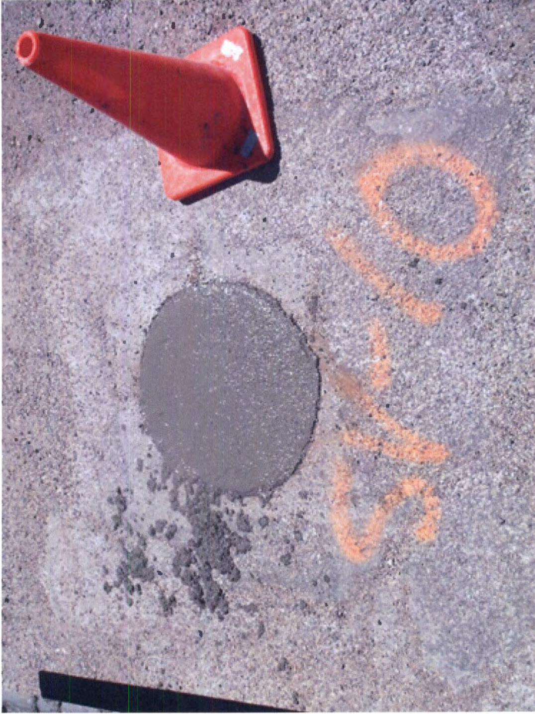
Photos: Plugged SVE-10 -- well casing and vault left in place. Gramms 66 site in Quinter, Kansas MILCO Project No. M269-P1-01

MILCO Environmental Services, Inc. 320 W. 4 th Street Colby, KS 67701 Tel: 785-460-1956 Fax: 785-460-4220