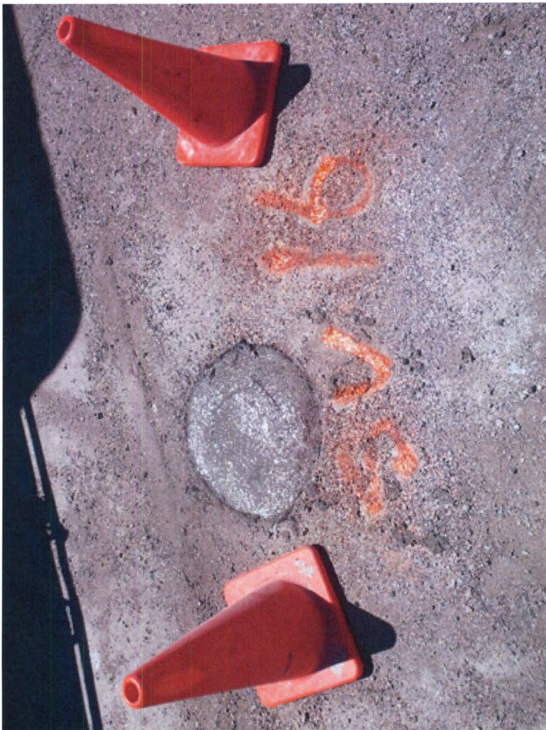
Photos: Plugged SVE-16 – well casing and vault left in place. Gramms 66 site in Quinter, Kansas MILCO Project No. M269-P1-01

MILCO Environmental Services, Inc. 320 W. 4 th Street Colby, KS 67701 Tel: 785-460-1956 Fax: 785-460-4220