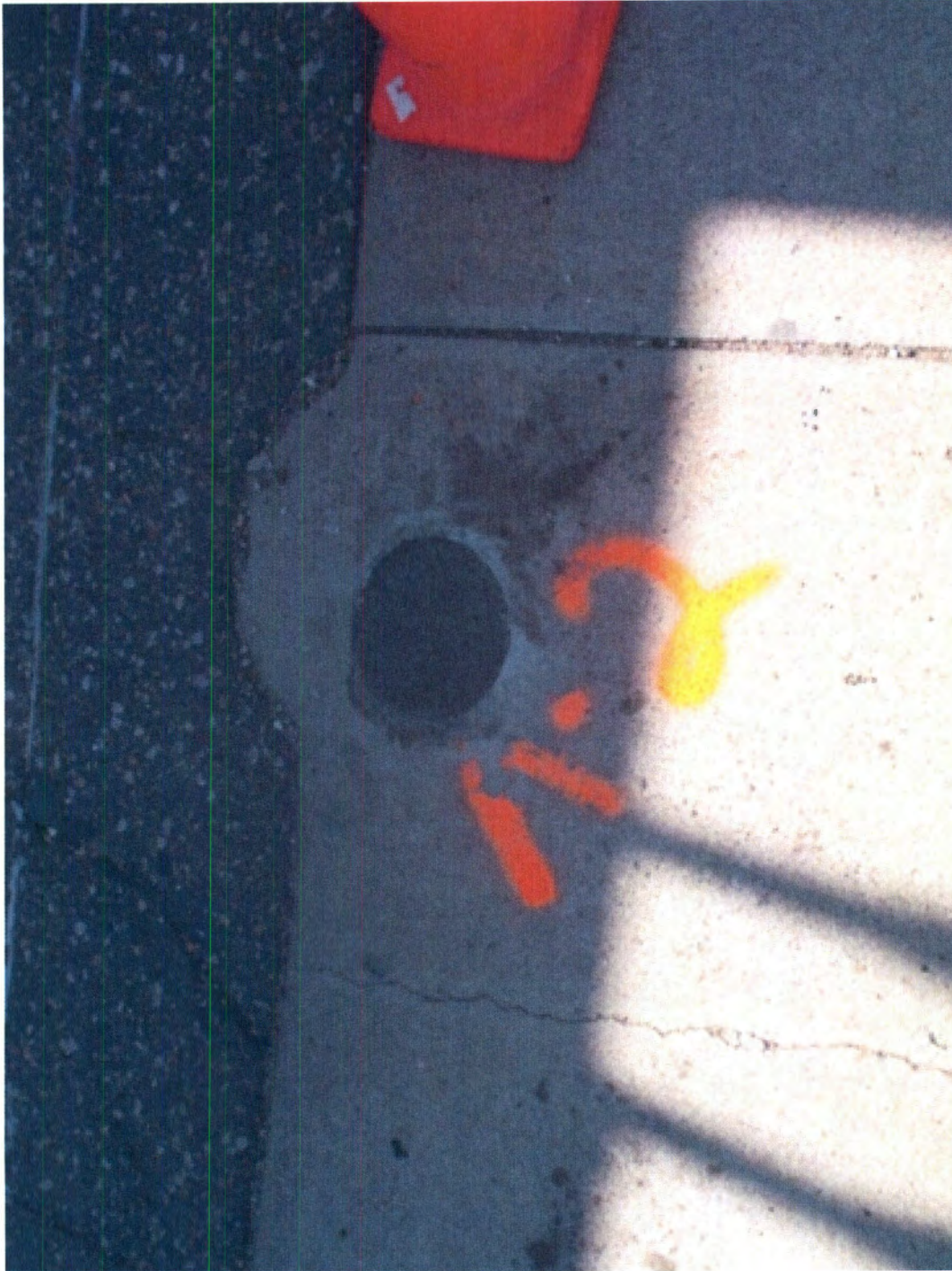
Photos: Plugged AS-2 – well vault left in place Holiday 66 site in Hays, Kansas MILCO Project No. M273-P8-01

MILCO Environmental Services, Inc. 320 W. 4 th Street Colby, KS 67701 Tel: 785-460-1956 Fax: 785-460-4220