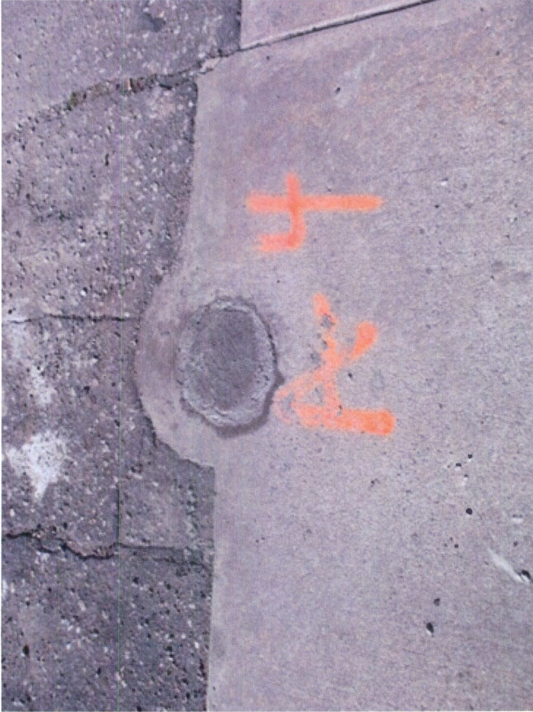
Photos: Plugged AS-4 – well vault left in place Holiday 66 site in Hays, Kansas MILCO Project No. M273-P8-01

MILCO Environmental Services, Inc. 320 W. 4 th Street Colby, KS 67701 Tel: 785-460-1956 Fax: 785-460-4220