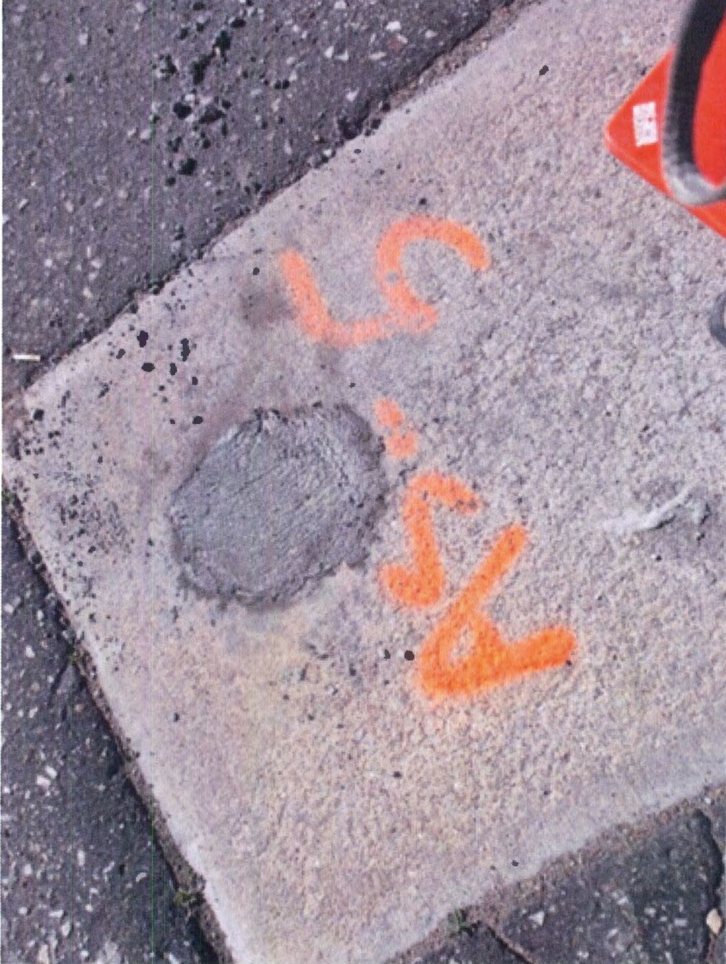
Photos: Plugged AS-5 – well vault left in place Holiday 66 site in Hays, Kansas MILCO Project No. M273-P8-01

MILCO Environmental Services, Inc. 320 W. 4 th Street Colby, KS 67701 Tel: 785-460-1956 Fax: 785-460-4220