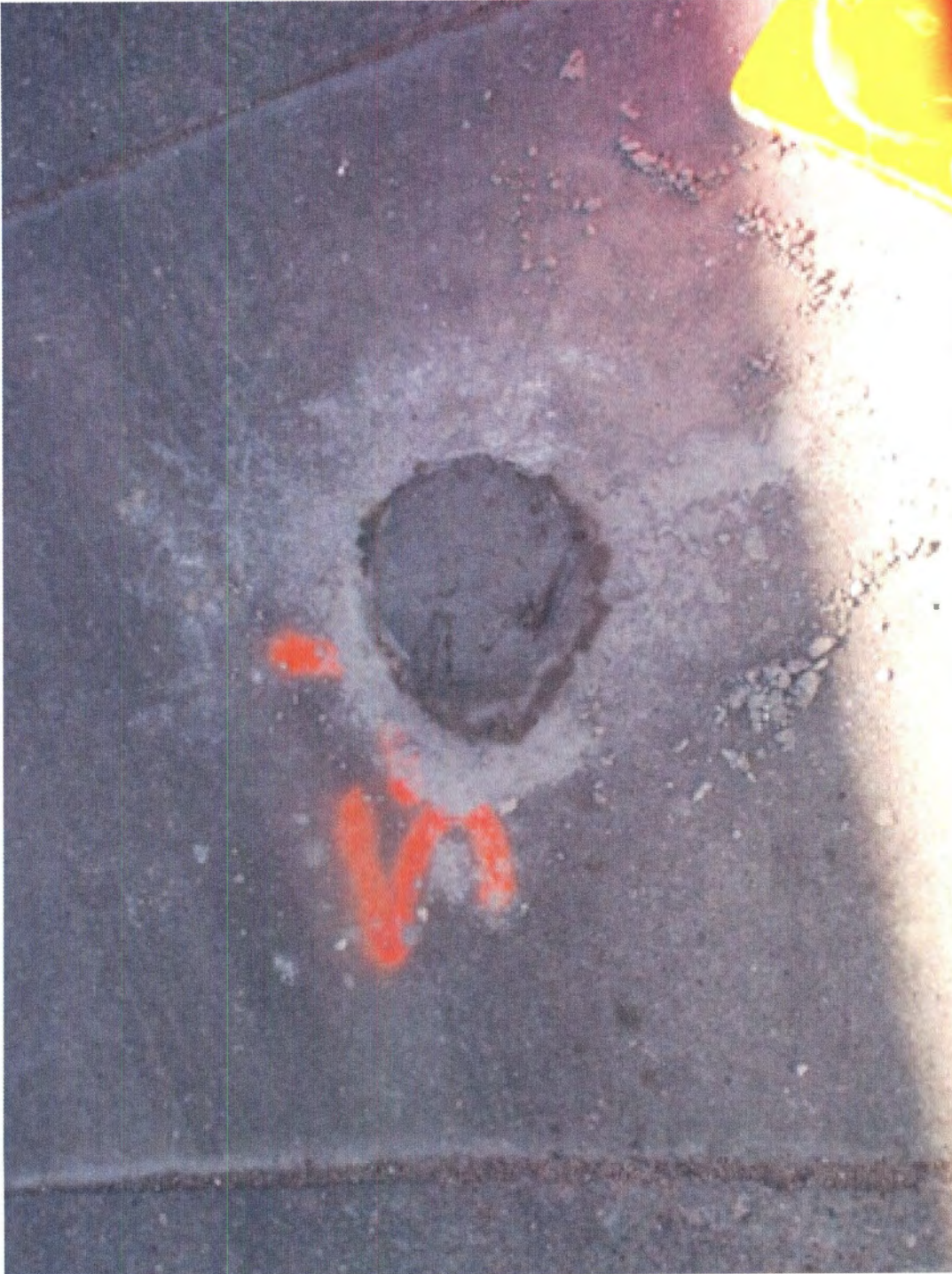
Photos: Plugged SVE-1 – well vault left in place Holiday 66 site in Hays, Kansas MILCO Project No. M273-P8-01

MILCO Environmental Services, Inc. 320 W. 4 th Street Colby, KS 67701 Tel: 785-460-1956 Fax: 785-460-4220