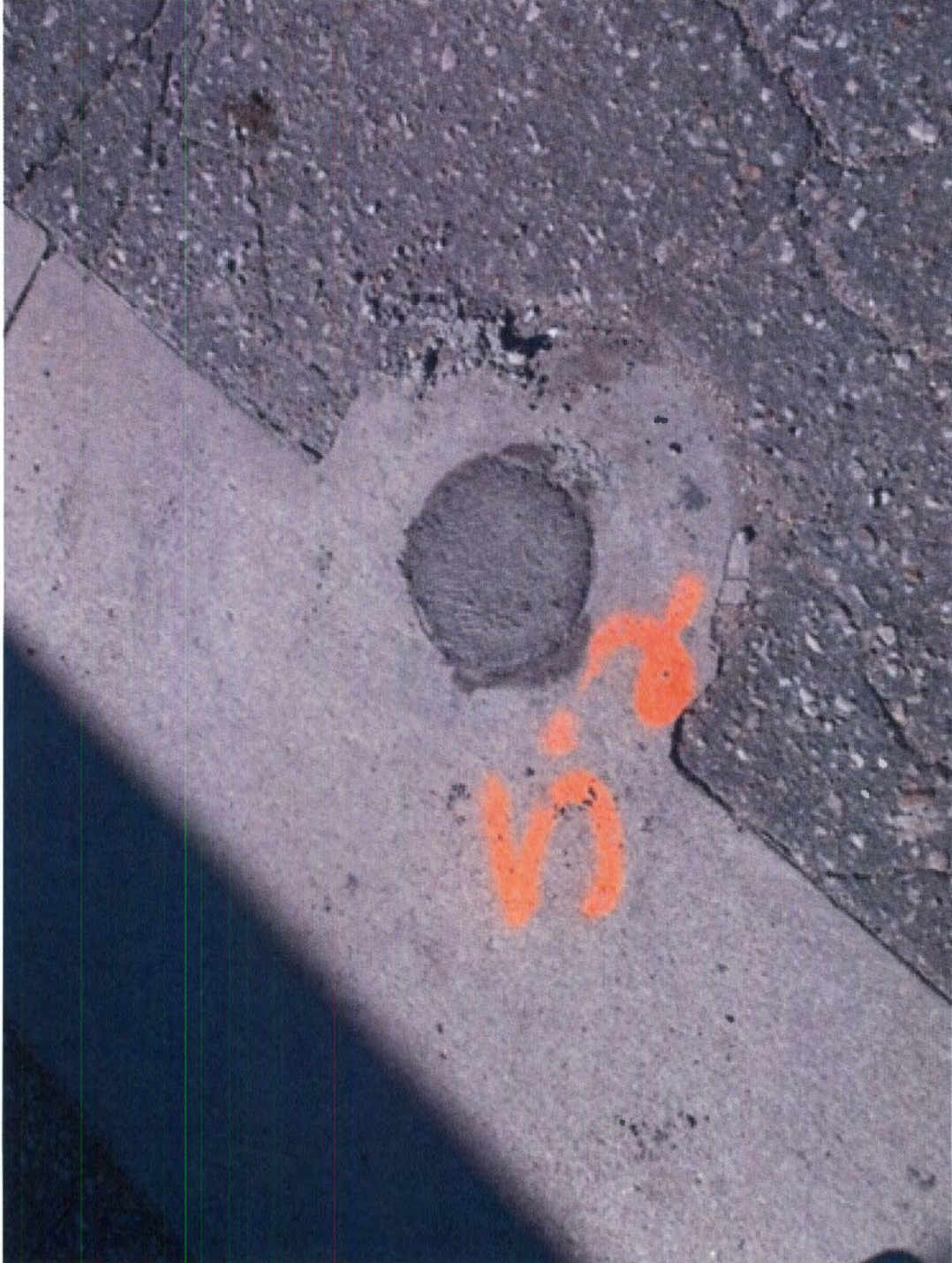
Photos: Plugged SVE-2 -- well vault left in place Holiday 66 site in Hays, Kansas MILCO Project No. M273-P8-01

MILCO Environmental Services, Inc. 320 W. 4 th Street Colby, KS 67701 Tel: 785-460-1956 Fax: 785-460-4220