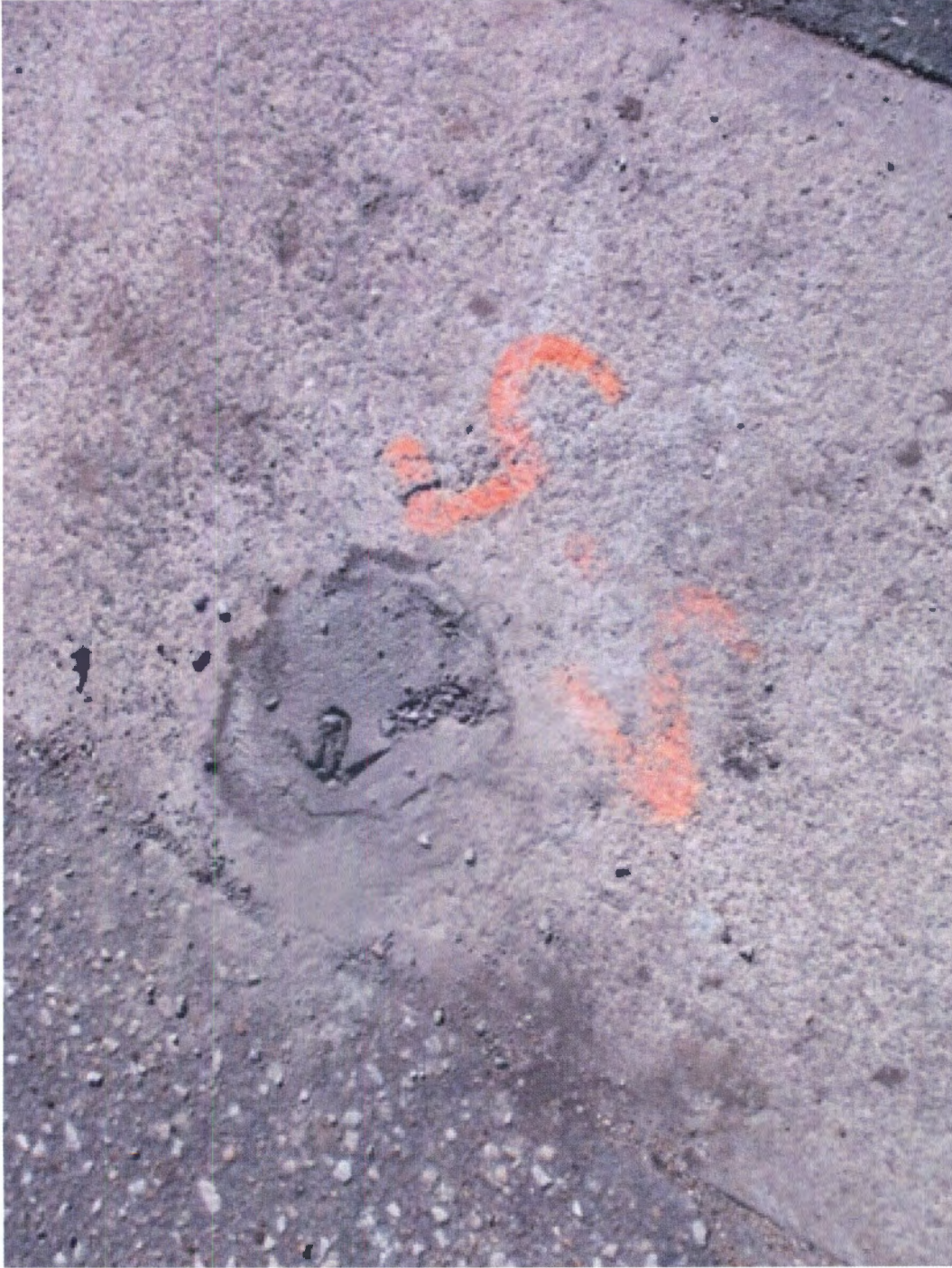
Photos: Plugged SVE-5 – well vault left in place Holiday 66 site in Hays, Kansas MILCO Project No. M273-P8-01

MILCO Environmental Services, Inc. 320 W. 4 th Street Colby, KS 67701 Tel: 785-460-1956 Fax: 785-460-4220