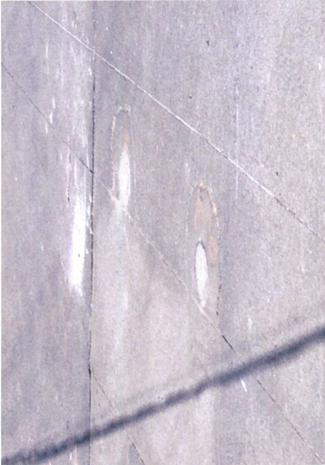
Photos: Plugged SVE-7 & AS-7 – well vault left in place Holiday 66 site in Hays, Kansas MILCO Project No. M273-P8-01