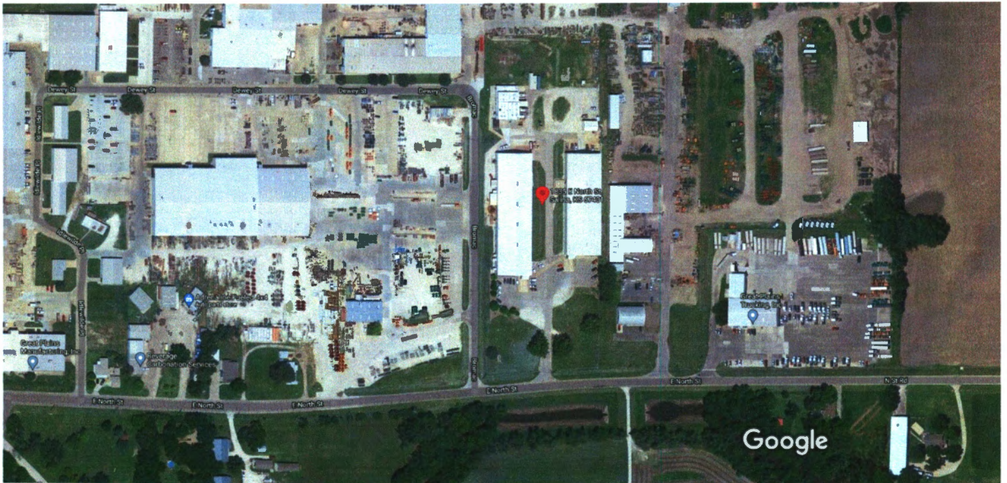
Imagery ©2021 Maxar Technologies, Map data ©2021 100 ft